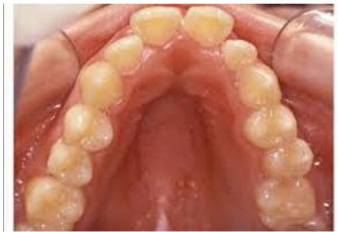
Figure 5 – Narrowed Palate

69. Warren and Bishara’s examination of the effect of the duration of pacifier use on different aspects of dental arch “found a statistically significant increased mandibular canine arch width and a statistically significant decrease in palatal depths” among prolonged pacifier users. See Schmid et al., supra note 9, at 8; see also Warren and Bishara, supra note 21, at 350-51.