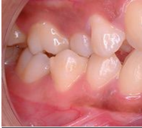
Figure 4 – Class II Malocclusion

67. Adair et al. found that “[c]lass II primary canine relationships on one or both sides were significantly more common among the pacifier group,” regardless of pacifier type, as compared to habit-free children. Adair et al., supra note 13, at 439. Among users of “orthodontic” pacifiers, Adair found that the “occurrences of Class II primary canines and distal step molars were statistically significantly greater among the users of functional exercisers.” Id. at 440. Dimberg et al. similarly showed that there was a statistically significant higher rate of Class II malocclusions in pacifier users. Dimberg, et al, supra note 21. 23