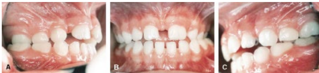
Figure 2 – Posterior Crossbite 20

57. Posterior crossbite (“PCB”) is a condition where the posterior top teeth are inside the posterior bottom teeth when touching, as depicted below: