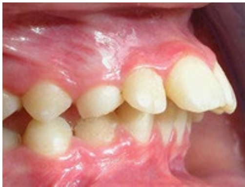
Figure 3 – Excessive Overjet

62. Overjet refers to the horizontal extension of the upper front teeth over the lower front teeth. Excessive overjet is another form of malocclusion that is more prevalent in children who use pacifiers, and is a condition where the upper front teeth are significantly further forward than the lower front teeth, as depicted below: