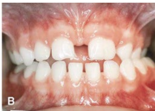
Figure 6 – Diastema 26

73. For example, diastema is a condition marked by increased spacing between the teeth, as depicted below: