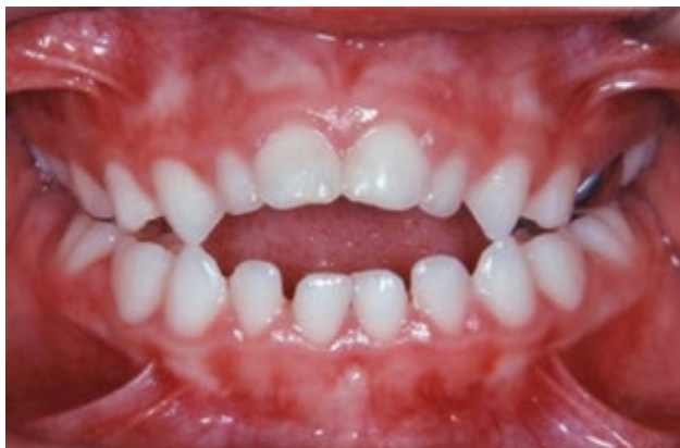
Figure 1 – Pacifier-Induced Anterior Open Bite 18

51. An anterior open bite (“AOB”) is a condition where the front teeth fail to touch, and there is no overlap between the upper and lower incisors, as depicted in the image below: