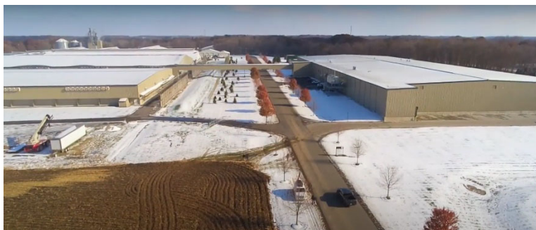
External image of facility run by Herbruck’s Poultry Ranch, an Eggland supplier.

37. To begin, hens that produce Cage Free eggs do not live in a “natural” environment. None of them ever have outdoor access. And many or all of them live in massive, industrial egg-laying compounds, such as the one shown below: