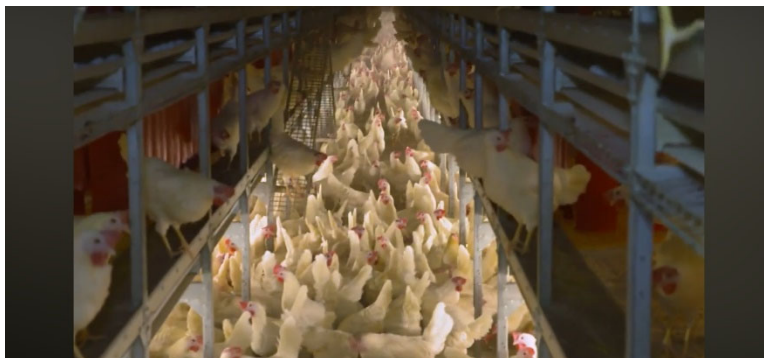
June 2021 image from cage free farm run by Herbruck's Poultry Ranch, a supplier for Eggland's Best.

41. The facilities at which Cage Free hens live also are not "pleasant." They often cram hundreds of thousands of hens into a single building and devote approximately one square foot (or less) of floor space to each bird. Images from such facilities are below.