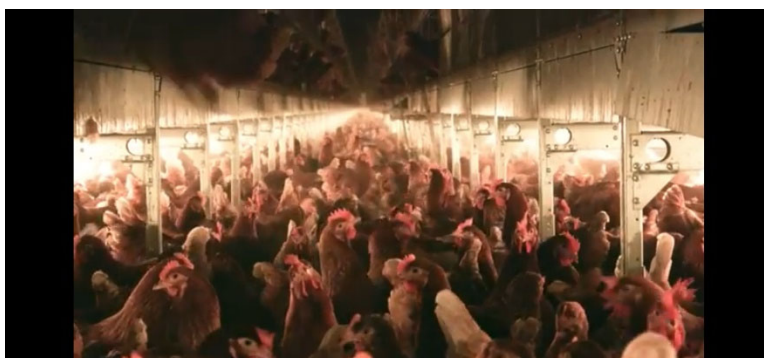
November 2015 image from cage free farm run by Herbruck's Poultry Ranch, a supplier for Eggland's Best.