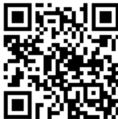
21 Fig. 2. A young mother promotes using a Stanley cup while breastfeeding in an advertisement paid 22 for by PMI. The paid partnership video is still available on Instagram and can be watched by scanning 23 the QR Code as of the date of filing.