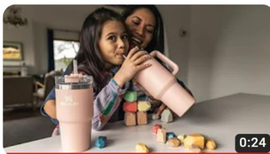
7 8 9 10 11 12 13 The Stanley Adventure Quencher: ⋮ 14 Now in 4 sizes 15 98K views • 1 year ago

1 27. PMI markets its products as safe, fashionable choices for conscientious 2 consumers, especially those leading young families. PMI’s 3 advertisements feature cups in various colors popular with women. Its 4 ads often show the cups being used by young women exercising or 5 interacting with children. 22 One PMI advertisement on YouTube shows a 6 child drinking from a Stanley cup alongside her mother. 23