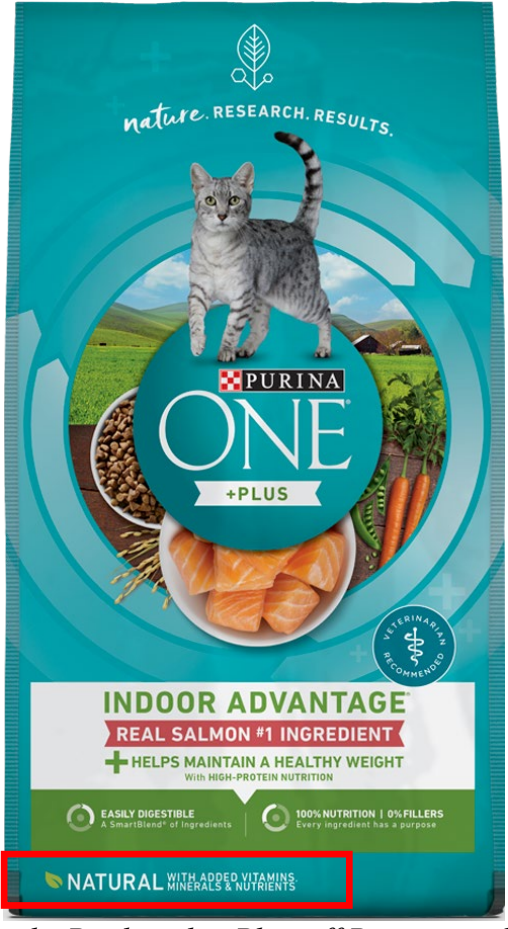
This is the Product that Plaintiff Pietres purchased.

added vitamins, minerals & nutrients," with the word "natural" in large font.