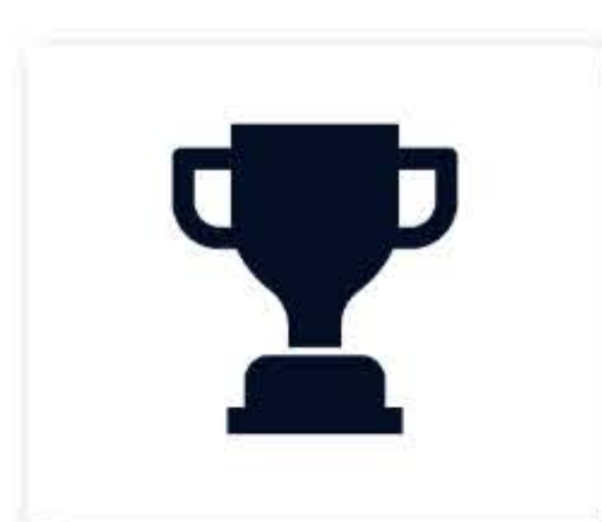
IOC REMUNERATION PLAN