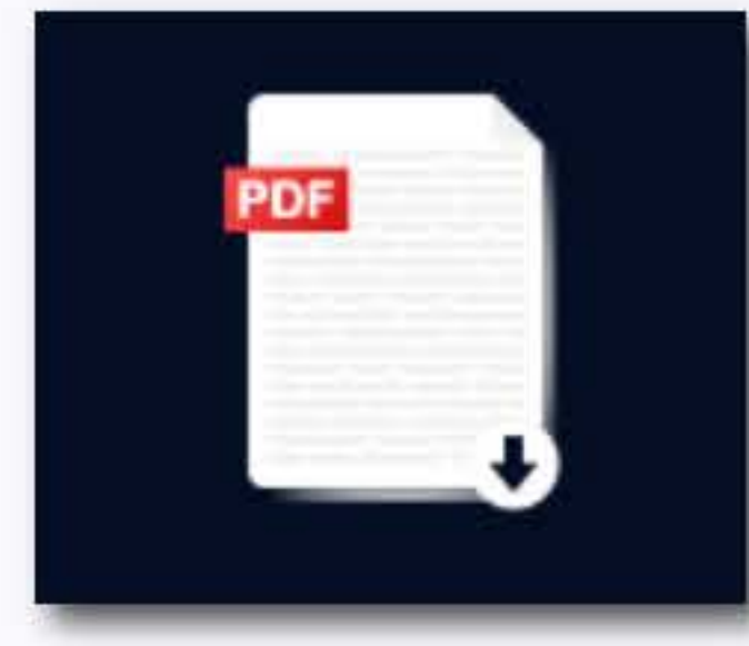
Retail Price List