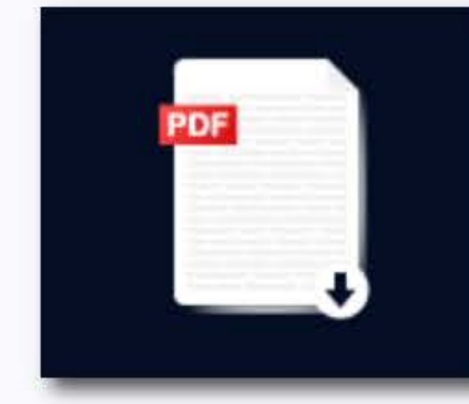
Product Order Form