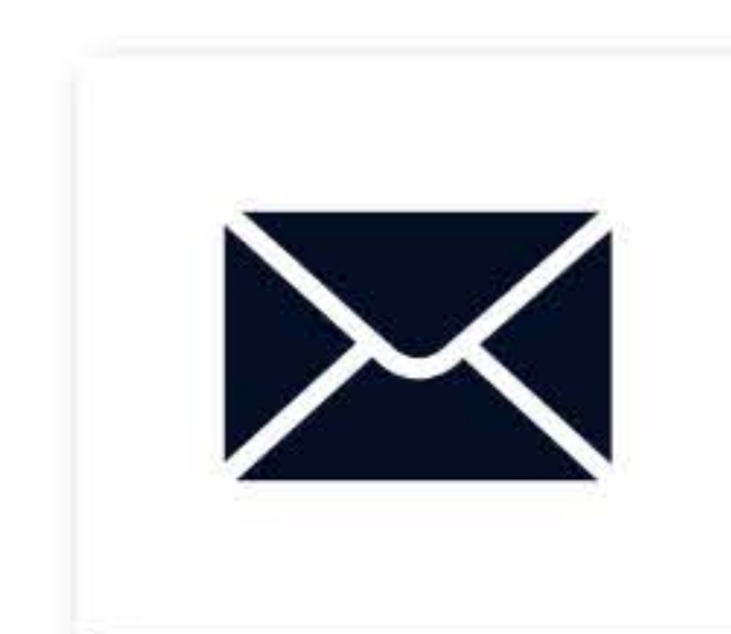
LETTER OF INTENT