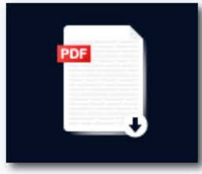
Distributor Price List