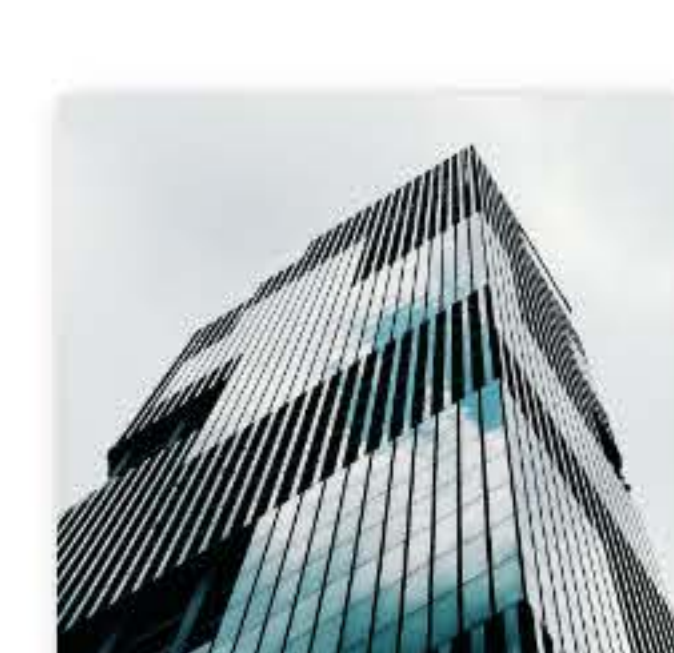
Visit nearest DXN Branch or Stockist