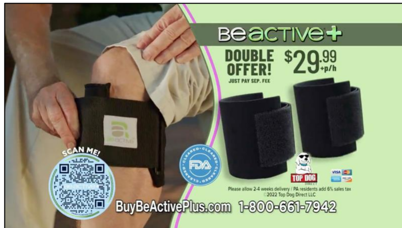
Screenshots from company website 3