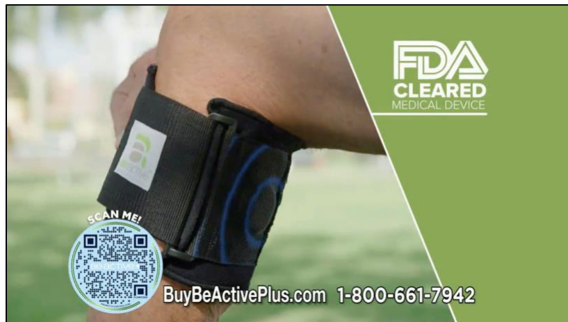
Screenshots from television commercial 2

We write on behalf of Truth in Advertising, Inc. (“TINA.org”) to inform you of Top Dog Direct’s improper use of FDA logos to promote its BeActive Plus brace in violation of the FDA’s Logo Policy. 1 Specifically, the Pennsylvania-based company prominently features FDA logos in marketing materials for the brace, including in a BeActive Plus television commercial and on the BeActive Plus website, despite the FDA’s ban against the use of its logos in private sector materials, sending the false and misleading message that the FDA “favors or endorses” BeActive Plus products.