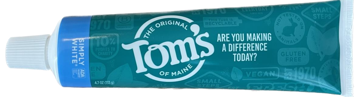
"THIS TUBE IS RECYCLABLE"

On the toothpaste tube itself, there is an image of a tube with the words "THIS TUBE IS RECYCLABLE," as well as a large chasing arrows logo, the universal recycling symbol, with the following recycling instructions underneath the logo: "Once empty, replace cap and recycle with #2 plastics."<sup>5</sup>