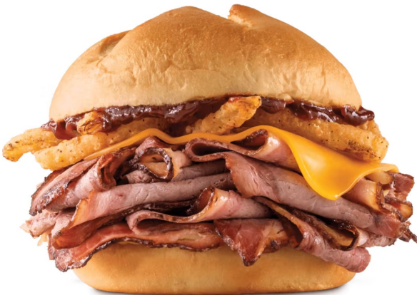
Smokehouse Brisket Advertisement