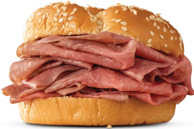
Classic Roast Beef Advertisement