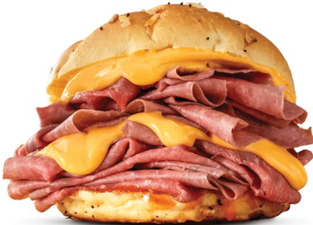
Double Beef 'N Cheddar Advertisement