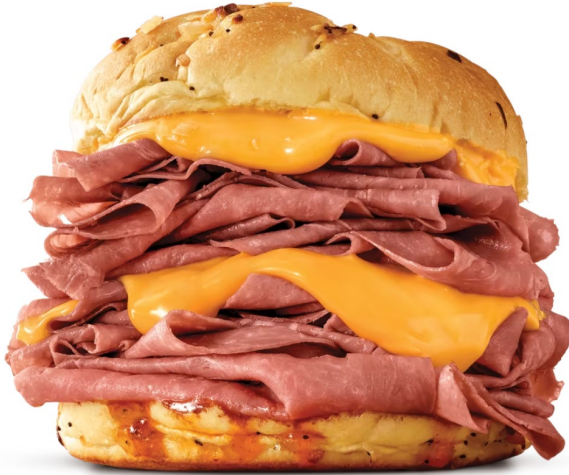
Half Pound Beef 'N Cheddar Advertisement