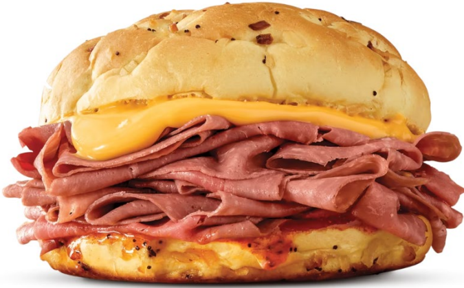
Classic Beef 'N Cheddar Advertisement