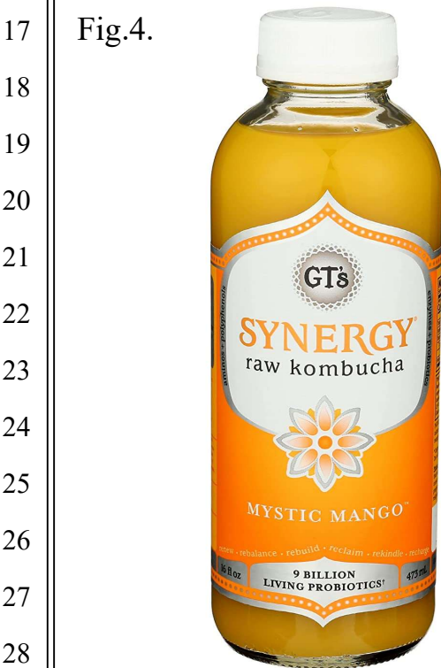
16 17 Fig.4.

INGREDIENTS: GT's Kombucha* (kombucha culture*, black tea*, green tea*, kiwi juice*), mango puree*, and 100% pure love!!!