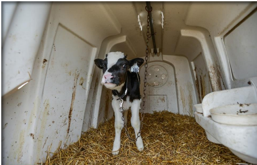
Jo-Anne McArthur / We Animals Media

49. Defendant, on information and belief, denies calves these demonstrated benefits, raising many calves for dairy production in individual isolation pens. These unfortunate calves are housed in individual hutches—small four-sided pens usually constructed of fiberglass, polyethylene, or wood. Calves are either tethered to hutches or restricted by fencing. While in these hutches, calves are alone, isolated from their mothers and other members of their species, until they reach an age where they will rejoin the herd, be impregnated, and begin to produce milk. The below image shows an interior of an industry-standard hutch: