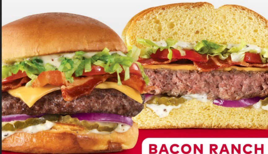
BACON RANCH WAGYU STEAKHOUSE BURGER

Our mouth-watering Wagyu Steakhouse Burgers are perfectly prepared. Adding bacon AND ranch is just unfair.