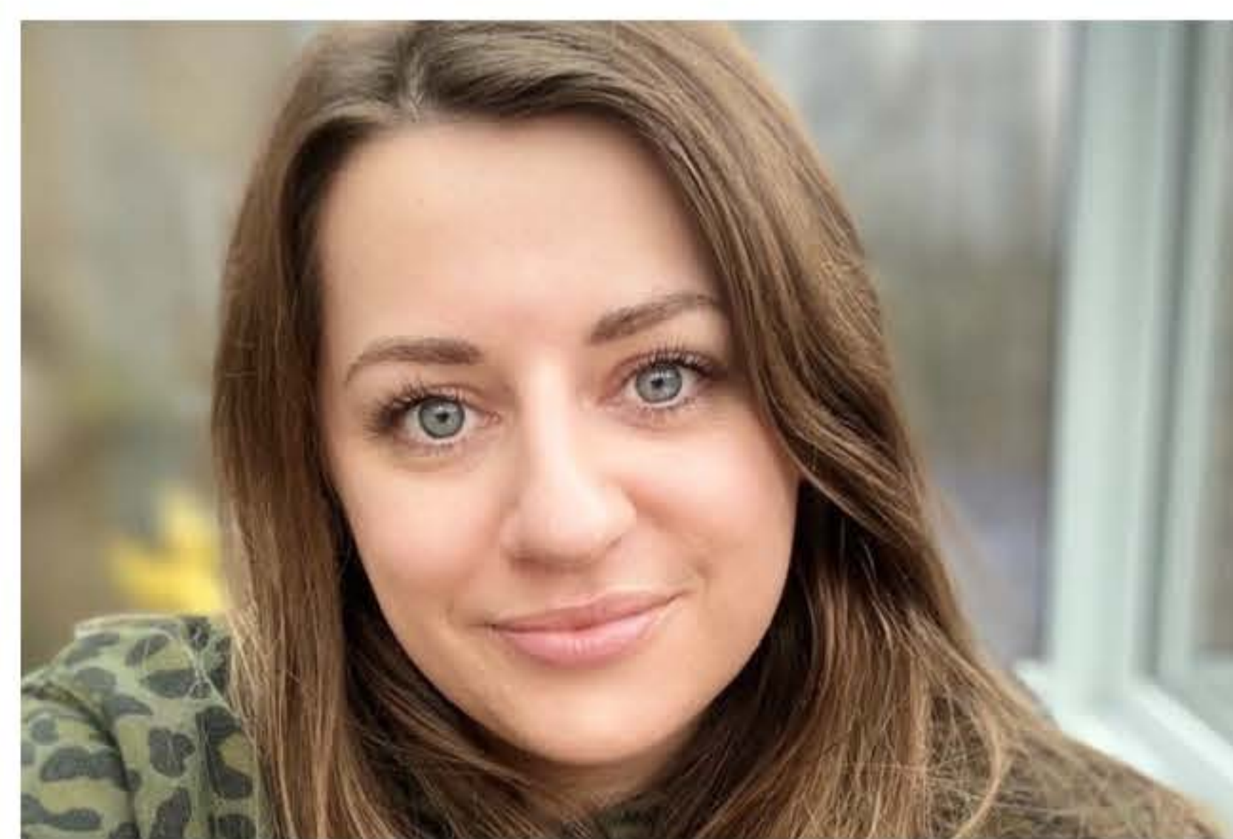
Leaving Your Comfort Zone Read More →