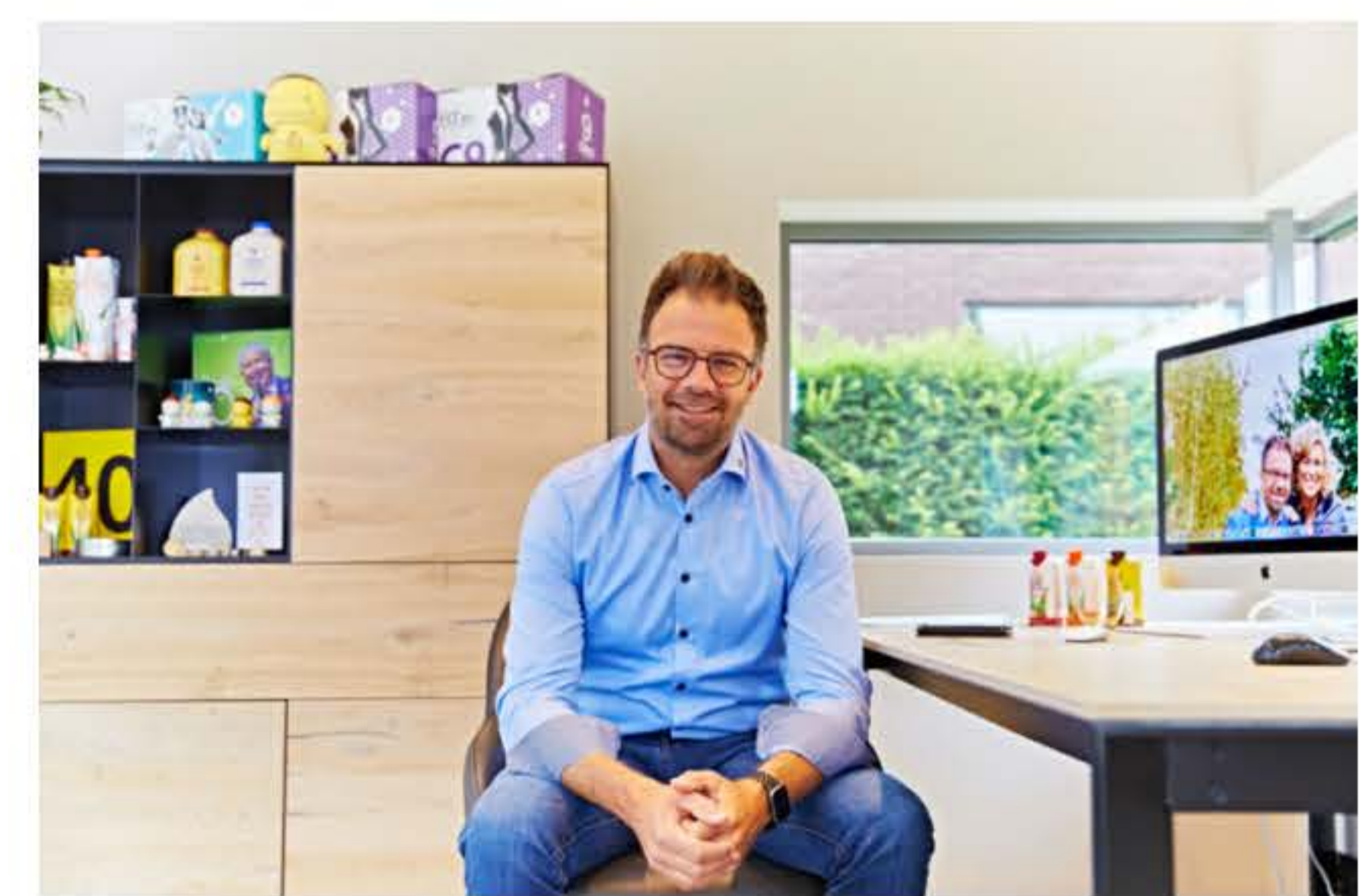
Developing Your Own Voice Read More →