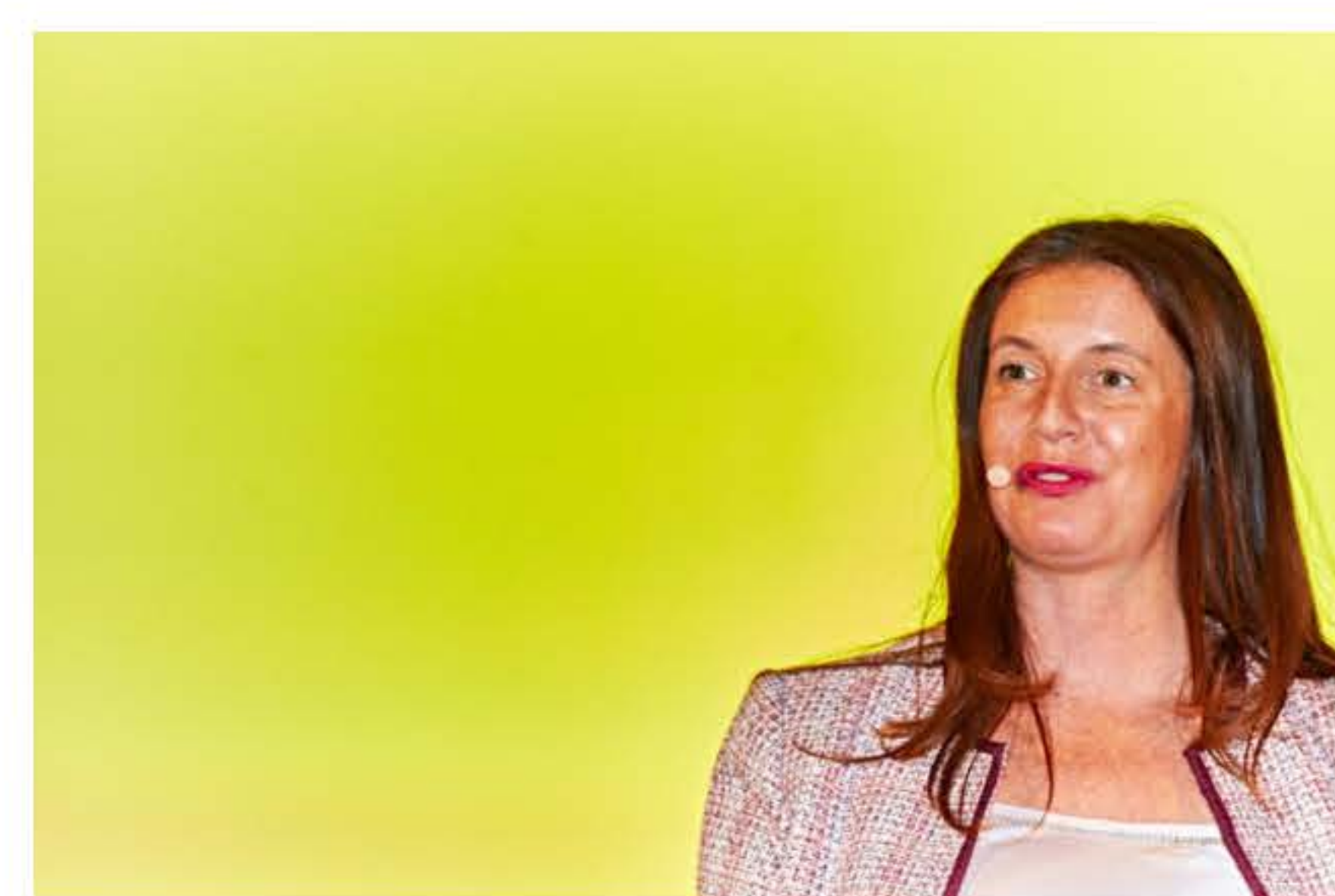
Finding More Time for Family Read More →