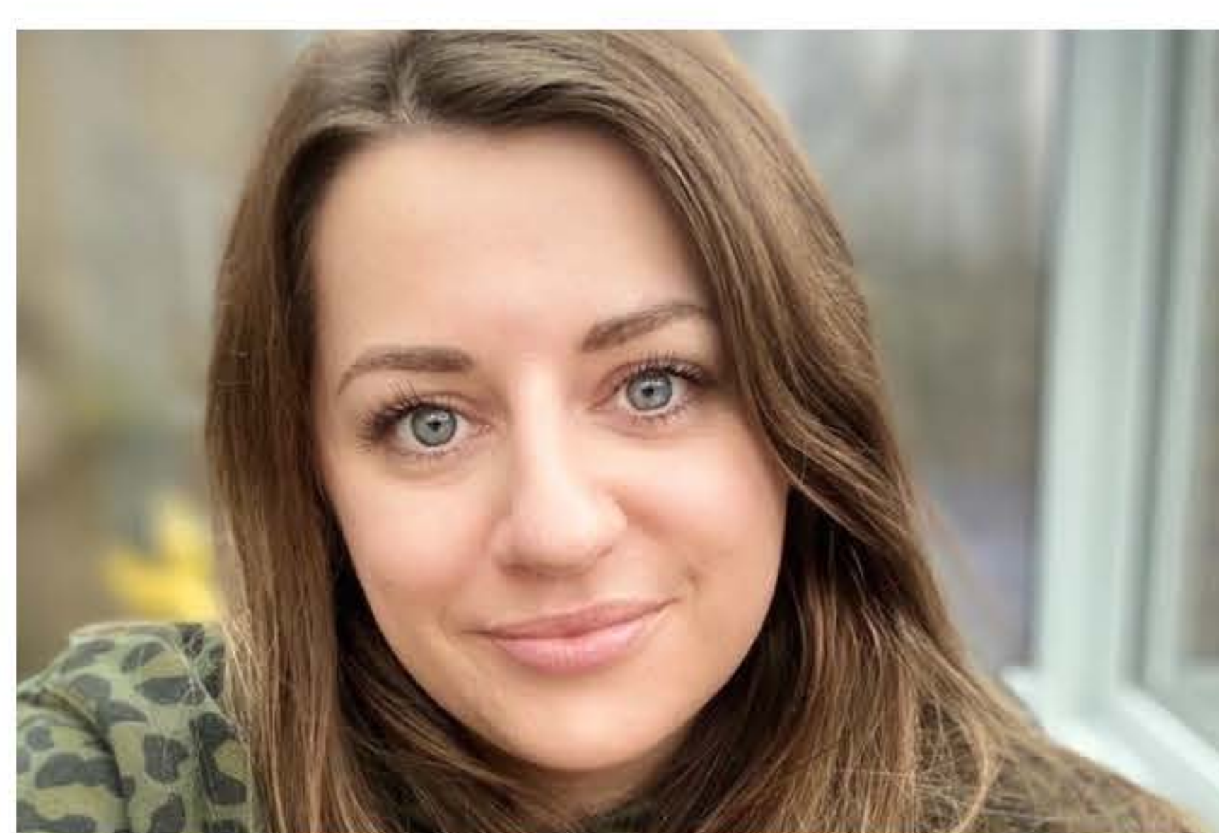
Leaving Your Comfort Zone Read More →