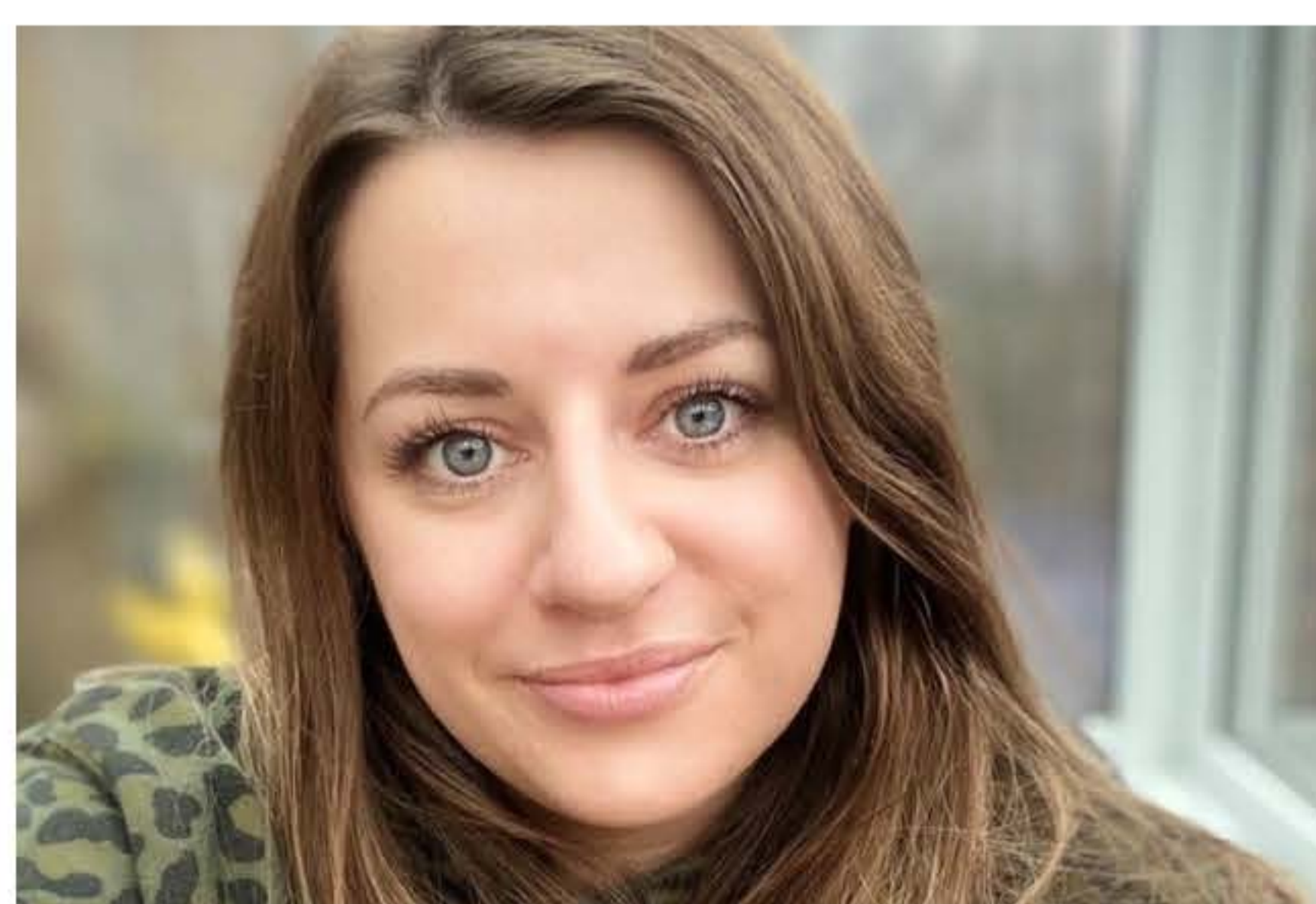
Leaving Your Comfort Zone Read More →