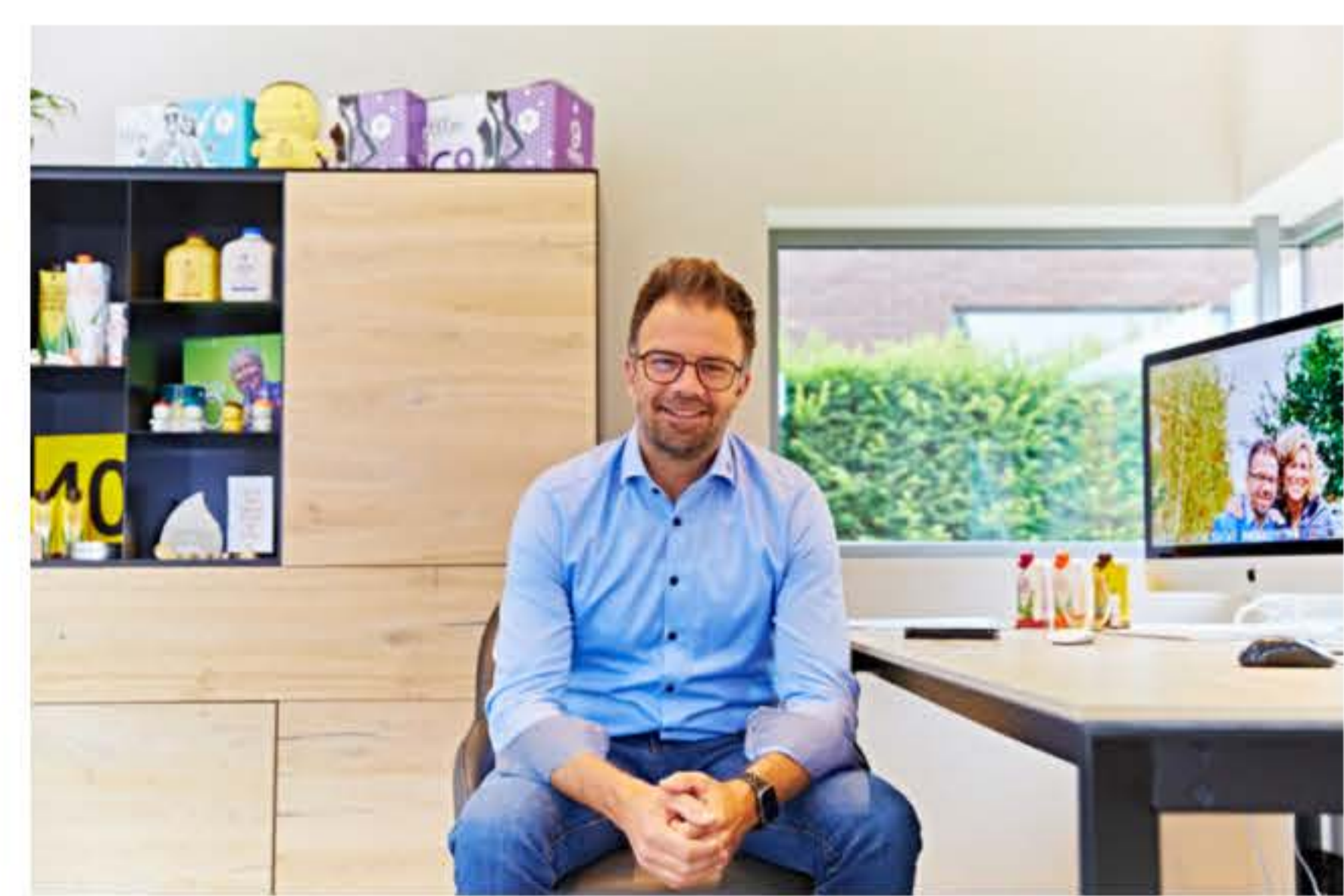
Developing Your Own Voice Read More →