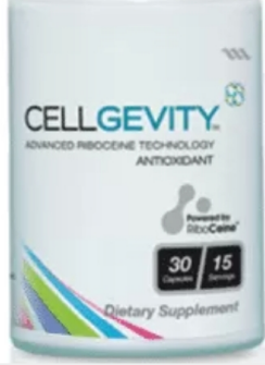
CELLGEVITY BY MAX INTERNATIONAL 1 x 30 CAPSULE PACK