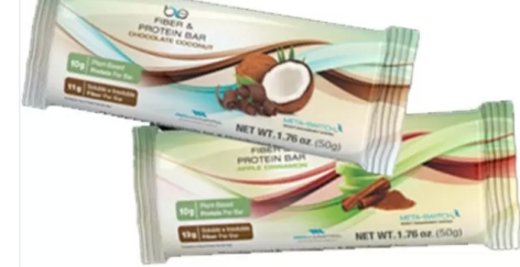
Meta-Switch™ Be™ Fiber & Protein Bar