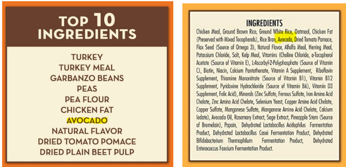
Figure 3 - Examples of Ingredient List Showing “Avocado” as a Main Ingredient

3. In addition, Defendants’ claimed “avocado” benefits do not derive from just any avocado – Defendants specifically target the California avocado and oil derived from California avocados to market and advertise their AvoDerm products. Defendants claim that their AvoDerm products are “ only made with the flesh or oil of California avocados .” 2 (emphasis added).