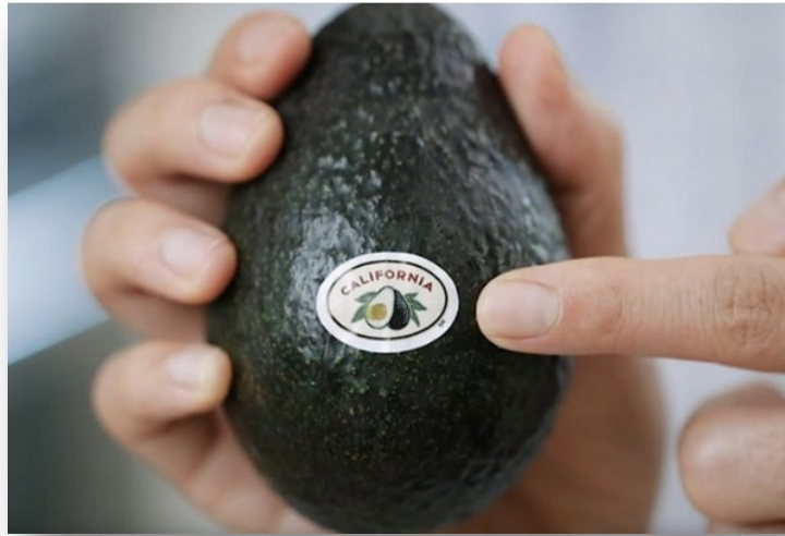
1 Figure 9 - Photograph of California Avocado Commission Marketing

10 11 41. Defendants have capitalized on these consumer preferences and claim 12 both that AvoDerm uses only the flesh of California avocados AND oil from 13 California avocados in their dog and cat food. Plaintiffs are informed and believe 14 that these claims are false.