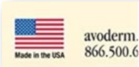
Figure 6 - Example of “Made in USA” Packaging Label

6. Plaintiffs seek relief for themselves and all others similarly situated to put a stop to Defendants’ deceptive marketing and advertising of its AvoDerm products based upon the following: