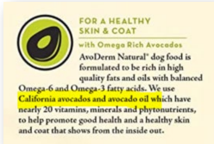
1 Figure 5 - Example of AvoDerm Packaging Advertising Use of “California” 2 Avocados and Avocado Oil

11 12 13 14 15 16 17 18 4. Defendants’ claims about the origins of the avocados and oil in the product—California—are also false. Plaintiffs are informed and believe that avocado and avocado oil used in AvoDerm products, if any, are not only sourced from avocados grown and pressed outside of California, but are from avocados grown and pressed outside the United States , including in Mexico, among potentially other foreign countries.