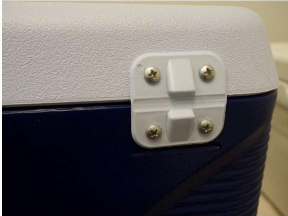
Many have complained about a lack of durability in the DuraChill's hinges.