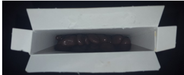
17 18 19 20 21 Butterfinger Bites®