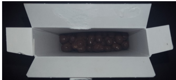
13 14 15 16 Raisinets®