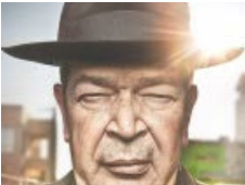
9 Reality TV 'Lies' You Believed Without Question