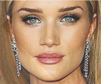
Victoria's Secret Angels: No Makeup, No Filters And No StyleBistro