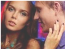
25 Things Never To Say To A Girl