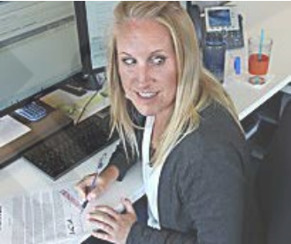
Pay Off Your House At A Furious Pace If You've Not Missed A LowerMyBills