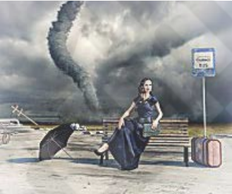
Visual Signs Your Life Is Not Balanced HealthPrep