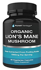
Organic Lions Mane Mushroom Capsules - 1800mg Lion's Mane Mushroom Supplement... 71