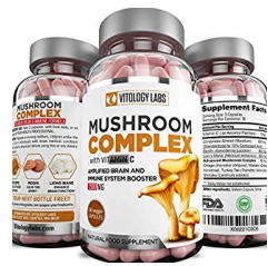
Vitology Labs| 2500MG Mushroom Supplement with Vitamin C - 7 Blend Lions Mane, Cord... 78