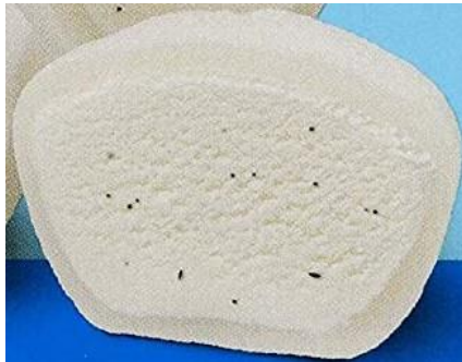
Front Label Image