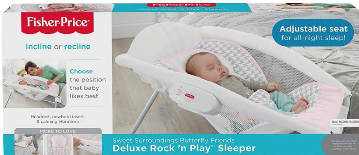
Above: Figure 8

97. The marketing statements on the packaging conflict with the AAP’s guidelines and recommendations, and those of other infant sleep experts.