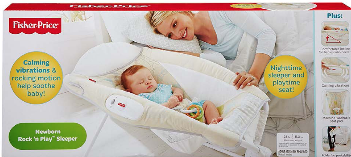
Above: Figure 7