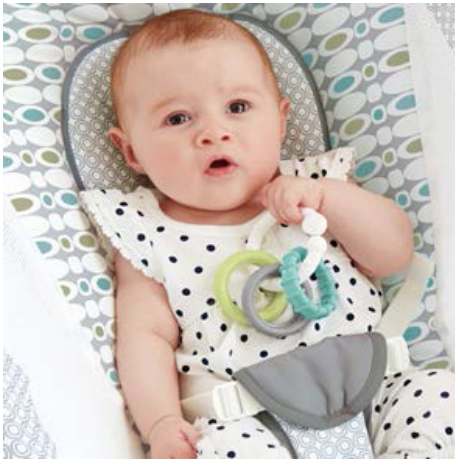
Above: Figure 3