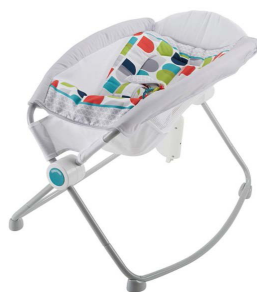
Above: Figure 1

32. A critical common design element of the Rock ’n Play Sleeper is a collapsible frame that supports a fabric hammock with tall sides (Figure 1), forcing the infant into a reclined position, with the head elevated at an approximately 30-degree angle from the lowest part of the baby’s torso (Figure 2) and restraints (Figure 3) that, if used as Defendants recommend, limit the baby’s motion at the hips and waist. There is a hard, plastic shell inside the hammock that is covered with soft padded material (Figures 4 and 5), upon which the baby is placed. Different views of the product are shown below: