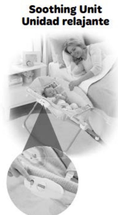
Above: Figure 11

129. The manuals are also deceptive in ways beyond the inadequate and misleading warning section. For example, the manuals show images of mothers lying down in bed, covered with blankets, which indicates either that they are ready for sleep or awakening from sleep. Below is an example: 52