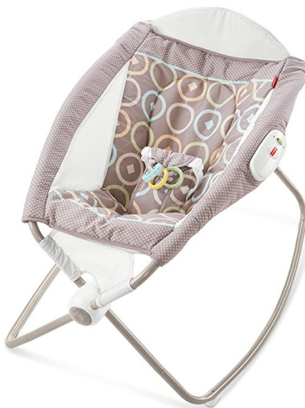
Above: Figure 4