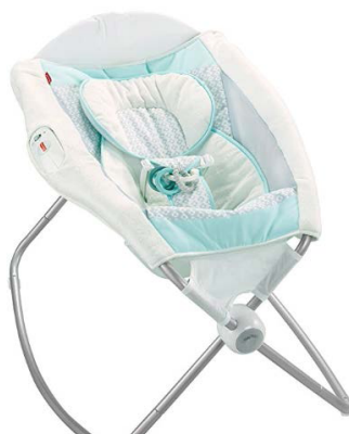
Above: Figure 5

33. Some “Premium” and “Deluxe” models, such as the deluxe model immediately above, have additional padding around the head.