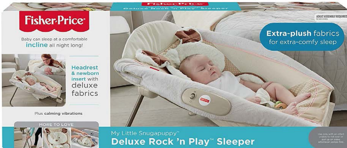
Above: Figure 6