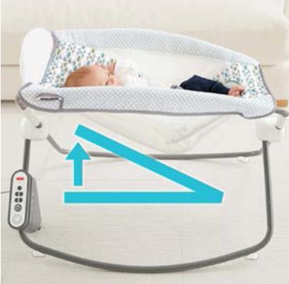
Above: Figure 2