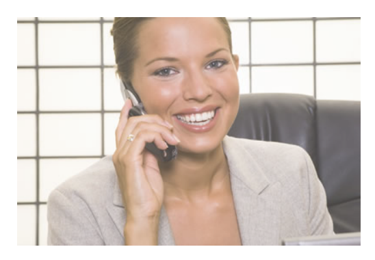
WEEKLY CALLS Stay Plugged In!

If unsure how to word a certain medical DIS-ease please ask! Also, we should be using disclaimers on all testimonies, posts etc. We will help guide you to be very successful in protecting our product and your business center!