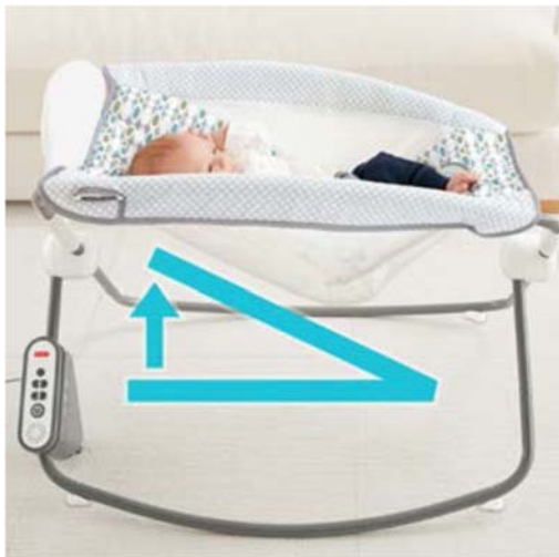
Above: Figure 2