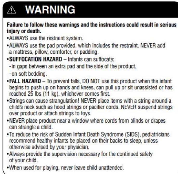
Above: Figure 10

126. Like the warning label on the padding, this warning omits the risk that use of the Rock 'n Play Sleeper can result in positional asphyxiation. Also like the warning label on the padding, this user manual warning instructs consumers to always use the restraint, but it does not disclose that keeping a baby restrained for extended periods of time can result in deformations to the head or neck. And, again, like the warning label on the padding, this warning instructs users to, “always provide the supervision necessary for the continued safety of your child,” but it ignores the fact that this is not possible when the baby is in the Rock 'n Play Sleeper for overnight sleep.