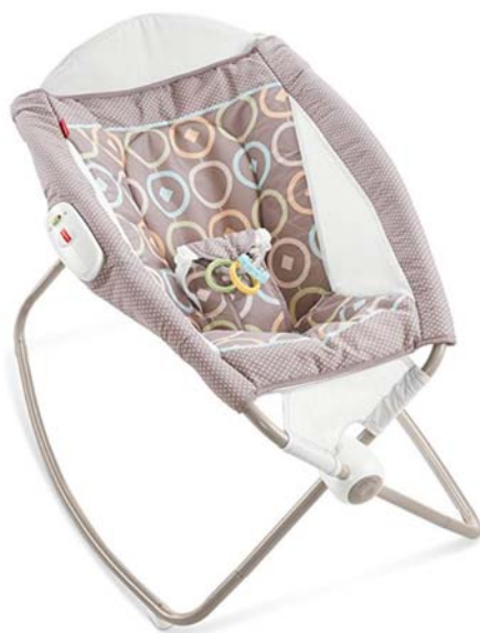
Above: Figure 4