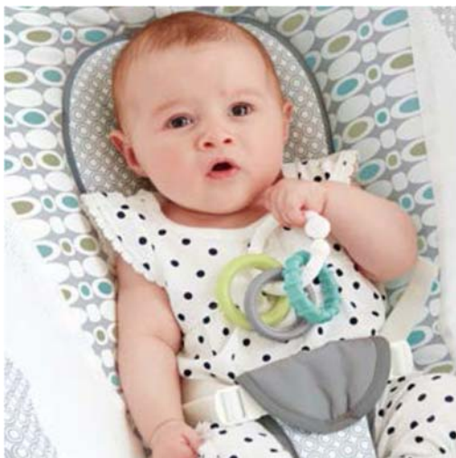
Above: Figure 3