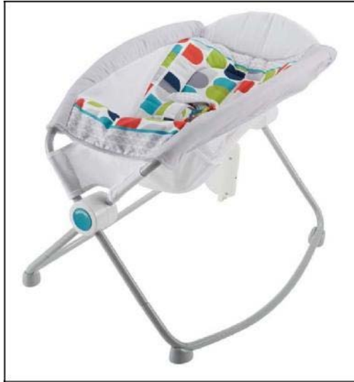
Above: Figure 1