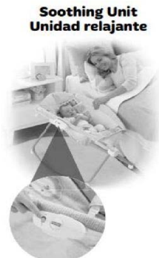
Above: Figure 11

129. The manuals are also misleading beyond the inadequate and misleading warning section. For example, the manuals show images of mothers lying down in bed, covered with blankets, which indicates either that they are ready for sleep or awakening from sleep. Below is an example: 54