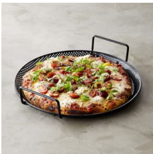
High-Heat Nonstick Pizza Pan ★★★★★ (7) Sugg. Price $39.95 Our Price $31.96