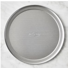
USA Pan Nonstick Pizza Pan, 12" $19.95