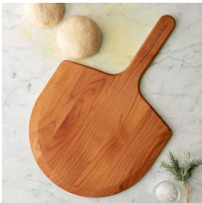
Williams Sonoma Wood Bread & Pizza Peel $44.95