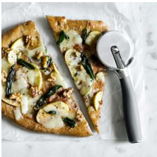
Williams Sonoma Prep Tools Pizza Wheel Sugg. Price $19.95 Sale $14.99 - $19.95