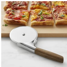
Williams Sonoma Wood-Handled Pizza Wheel ★★★★★ (1) $27.95