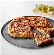
de Buyer Pizza Steel $19.95