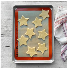
Silpat Silicone Baking Mat ★★★★★ (23) $21.95 - $39.95