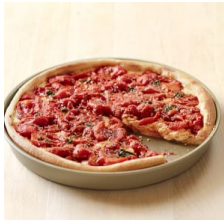
Williams Sonoma Goldtouch® Nonstick Deep-Dish Pizza Pan ★★★★★ (8) $29.95