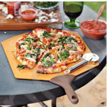
Epicurean Pizza Peel ★★★★★ (5) $39.95