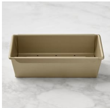
Williams Sonoma Goldtouch® Nonstick Meatloaf Pan with Insert ★★★★★ (45) $29.95