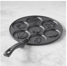
Nordic Ware Nonstick Pancake Pan, Fall Leaves ★★★★★ (1) Sugg. Price $47 Sale $31.99