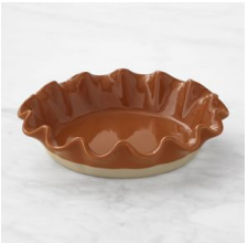
Emile Henry Artisan Deep Ruffled Pie Dish ★★★★★ (11) Sugg. Price $49.95 Sale $19.99