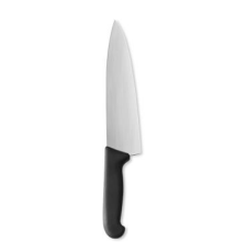
Victorinox Fibrox Pro 8" Chef's Knife ★★★★★ (2) Sugg. Price $48 Our Price $44.95