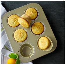
Williams Sonoma Goldtouch® Nonstick Muffin Pan ★★★★★ (8) $25.95