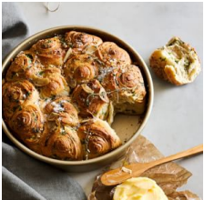
Williams Sonoma Goldtouch® Nonstick Round Cake Pans ★★★★★ (67) Sugg. Price $19.95 – $49.90 Our Price $19.95 – $44.95