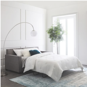
Henry® Basic Queen Sleeper Sofa $4,899 $2,299 Special $1,520 – $2,299