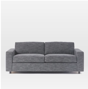
Urban Queen Sleeper Sofa $2,499 $2,499 Special $1,540 – $2,499