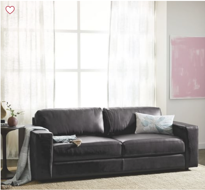
View Larger Roll Over Image to Zoom

Home > Search Results > Urban Leather Sleeper Sofa