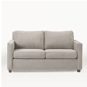
Henry® Basic Twin Sleeper Sofa Overnight success story. The clean lines, easy comfort ... View More