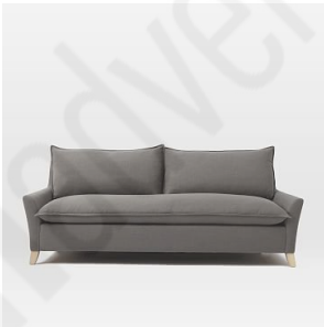
Bliss Queen Sleeper Sofa Dream come true. Our popular Bliss Sofa now ... View More