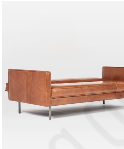
Axel Full Leather Futon (82.5") $2,999 $3,099 Special $2,400 – $3,099