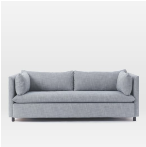
Shelter Queen Sleeper Sofa $2,099 $2,499 Special $1,680 – $2,499