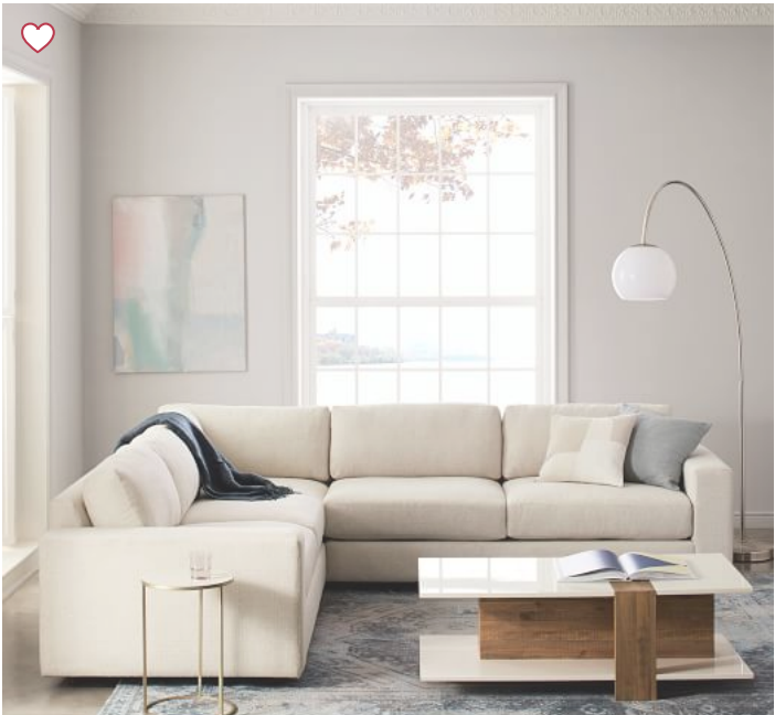
View Larger Roll Over Image to Zoom

Home > Search Results > Urban 3-Piece L-Shaped Sectional