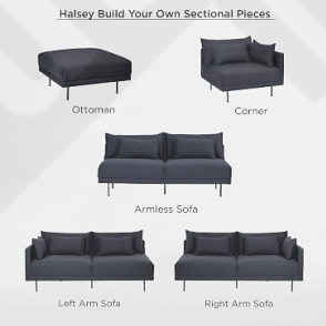
Build Your Own - Halsey Sectional Pieces The squared silhouette of our Halsey Sectional matches ... View More