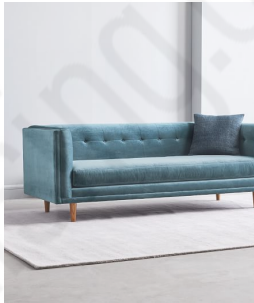
Bradford Sofa (82") $999 $1,399 Special $800 – $1,399