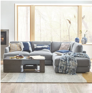
Haven 2-Piece Terminal Chaise Sectional $2,798 – $3,398