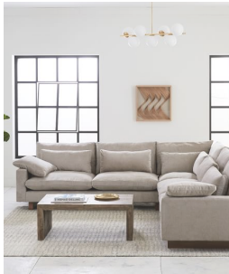
Harmony Down-Filled L-Shaped Sectional $4,297 $5,897 Special $3,438 – $5,897