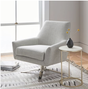
Lucas Swivel Chair $699 $999 Special $525 – $999