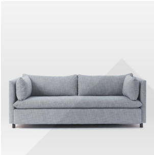
Shelter Queen Sleeper Sofa $2,099 $2,499 Special $1,680 – $2,499