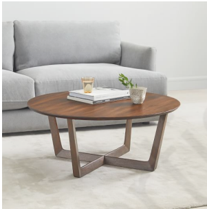
Stowe Coffee Table $299 Special $240