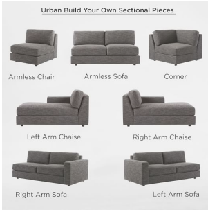
Build Your Own - Urban Sectional Pieces $1,149 $1,949 Sale $559.99 – $1,949