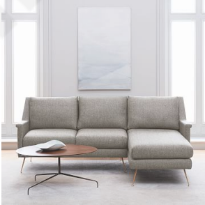
Carlo Mid-Century 2-Piece Chaise Sectional Strong in profile, our Carlo Mid-Century Sectional echoes ... View More