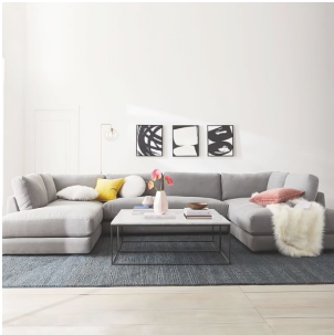
Haven U-Shaped Sectional $3,897 – $4,697