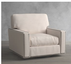
Turner Square Arm Upholstered Swivel Armchair With Nailheads $1,399 – $1,899