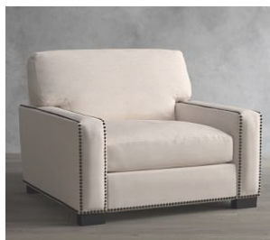
Turner Square Arm Upholstered Armchair With Nailheads $1,199 – $1,799