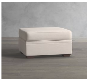
Pearce Roll Arm Upholstered Storage Ottoman $619 – $869