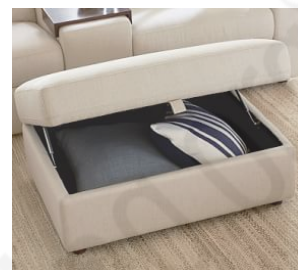
PB Ultra Lounge Upholstered Sectional Storage Ottoman $399 – $899