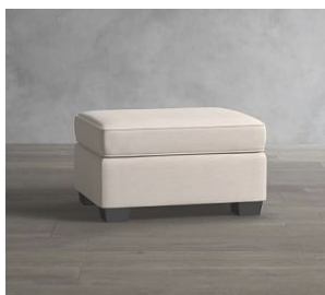
PB Comfort Upholstered Storage Ottoman $599 – $849