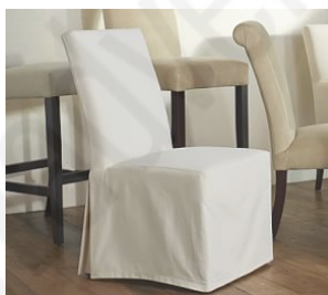
PB Comfort Square Slipcovered Dining Chairs $149 – $749