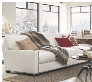
Turner Square Arm Upholstered Sofa With Nailheads $1,749 – $3,449