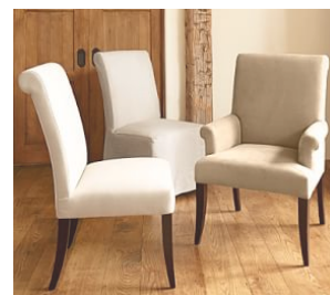
PB Comfort Roll Upholstered Dining Chairs $449 – $749 Sale $268.99 – $749