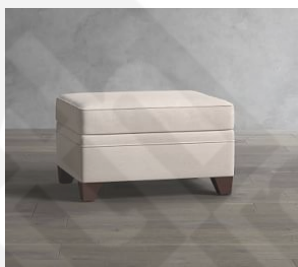
Cameron Upholstered Storage Ottoman $559 – $809