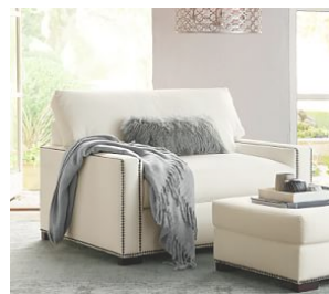
Turner Square Arm Upholstered Twin Sleeper Sofa With Memory Foam Mattress And Nailheads $2,249 – $3,249