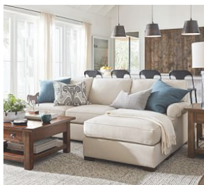
Townsend Roll Arm Upholstered Sofa With Reversible Storage Chaise Sectional