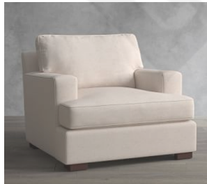
Townsend Square Arm Upholstered Armchair $899 – $1,499