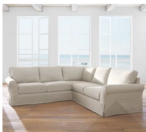
PB Comfort Roll Arm Slipcovered 3-Piece L-Shaped Sectional With Corner