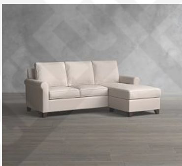
Cameron Roll Arm Upholstered Sofa with Reversible Chaise