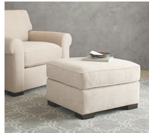
Townsend Upholstered Ottoman $549 – $799