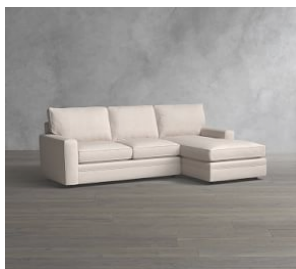
Pearce Square Arm Upholstered 2-Piece Sectional With Chaise