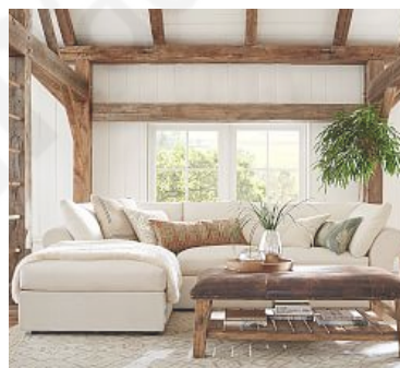
PB Air Roll Arm Upholstered 4-Piece Sofa with Chaise