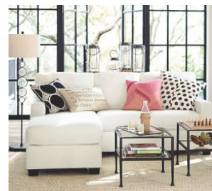
Buchanan Square Arm Upholstered Sofa With Reversible Chaise Sectional