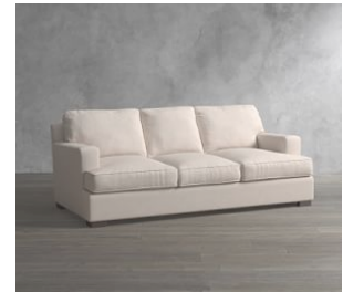
Townsend Square Arm Upholstered Sofa $1,499 – $2,799