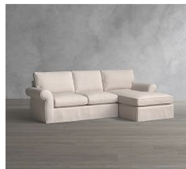
Pearce Roll Arm Slipcovered Sofa with Chaise Sectional