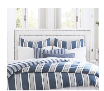
Tamsen Square Upholstered Headboard Special $749 – $4,295