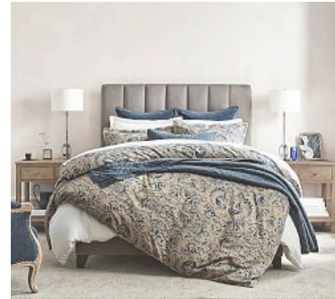
Kira Channel Tufted Upholstered Bed