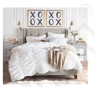
Harper Upholstered Tufted Low Bed $1,649 - $2,849