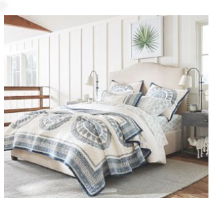
Raleigh Upholstered Curved Tall Bed $999 – $2,199