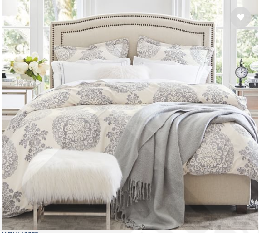
Home > Furniture > Upholstery Crafted In America > Beds & Headboards > Tamsen Curved Upholstered Bed