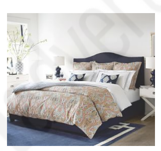
Raleigh Upholstered Curved Low Bed $899 – $4,095