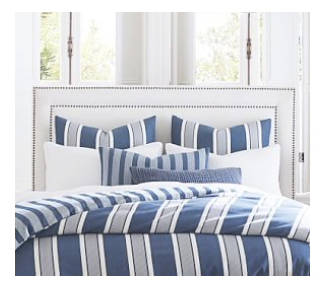
Tamsen Square Upholstered Bed Special $1,099 – $2,299