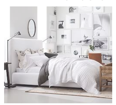
Big Sur Upholstered Bed