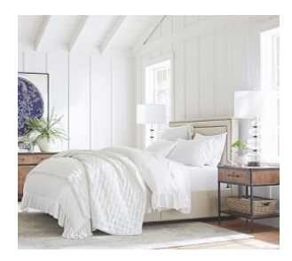
Tamsen Square Storage Bed $2,645 – $4,395