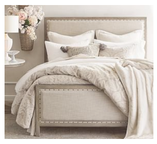
Toulouse Wood Bed $1,599 - $1,899 Special $1,519 - $1,804