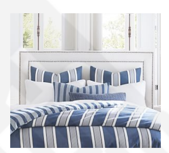
Tamsen Square Upholstered Bed $1,099 - $2,299