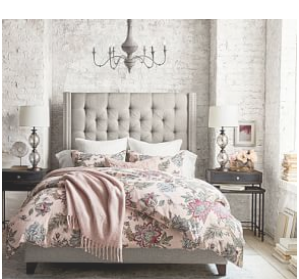
Harper Upholstered Tufted Tall Bed $2,399 - $2,899 Sale $1,438.99 - $2,899