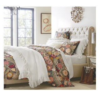
Chesterfield Tufted Upholstered Bed $1,999 $2,499 Sale $999.99 - $2,499