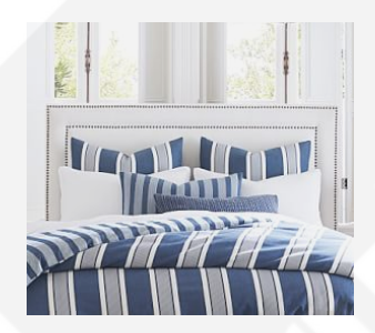
Tamsen Square Upholstered Bed $1,099 – $2,299