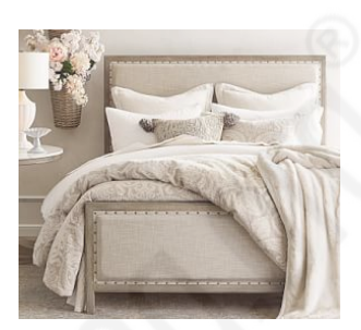
Toulouse Wood Bed $1,599 - $1,899 Special $1,519 - $1,804