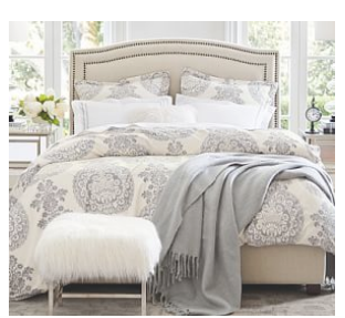
Tamsen Curved Upholstered Bed $1,399 $2,299 Sale $838.99 - $2,299