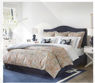
Raleigh Upholstered Curved Low Bed $899 – $4,095