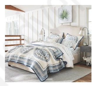
Raleigh Upholstered Curved Tall Bed $999 - $2,199