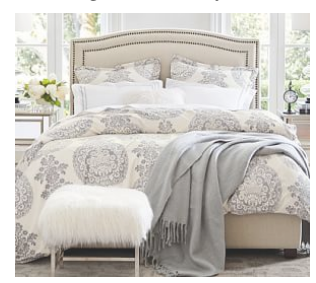
Tamsen Curved Upholstered Bed $1,099 $2,299 Sale $838.99 - $2,299