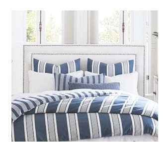
Tamsen Square Upholstered Headboard Special $749 – $4,295