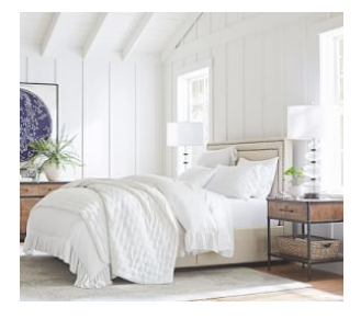
Tamsen Square Storage Bed $2,645 – $4,395