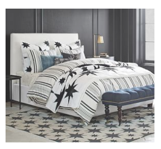
Raleigh Upholstered Square Low Bed $899 – $2,099