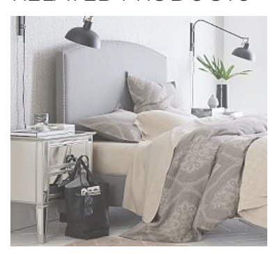
Fillmore Curved Upholstered Tall Bed The slightly angled silhouette of this bed's