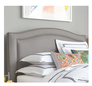
Tamsen Curved Upholstered Headboard $949 - $1,399 Sale $474.99 - $1,399