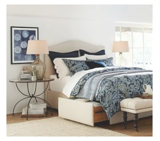
Upholstered Storage Platform Bed With Side Drawers $2,449 $3,049 Sale $1,468.99 $3,049