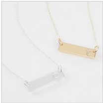
Acrylic Balance Bar Necklace $59