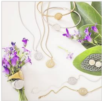
Sarah Chloe Necklace $79 – $435