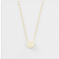
Zoey Necklace $55