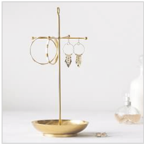
Lena Necklace Holder $19.50