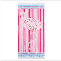
Lilly Pulitzer Flamingo Beach Towel $34.50