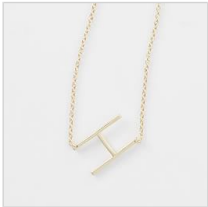
Sideways Initial Necklace $48