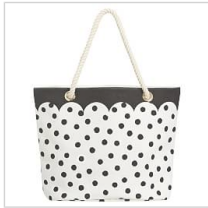
The Emily & Meritt Black/White Dot Rope Beach Tote $49.50