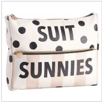
The Emily & Meritt Suit And Sunnies Pouch $25.50