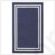
Decorator Border Rug $149 – $699 Special $119 – $559