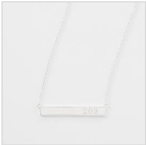
Lily Bar Necklace $65