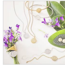
Sarah Chloe Cara Monogram Bracelet $98 - $347