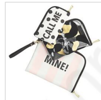
The Emily & Meritt Pouch Bundle, Set of 3 $39.50