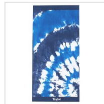
Tie Dye Burst Beach Towel, Blue $29 Special $23