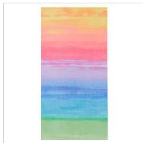
Ombre Rainbow Beach Towel $29 Special $23