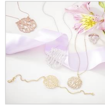
Monogram Cursive Pendant $159 - $1,229