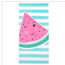
Watermelon Icon Beach Towel $29 Special $23