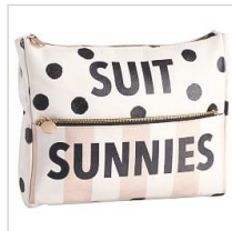
The Emily & Meritt Suit And Sunnies Pouch $25.50