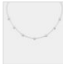
Hailey Star Necklace Add sparkling star style to your ensemble. Crafted ...