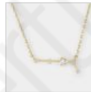
Nova Constellation Necklace What's your sign? This chic 14k gold necklace ...