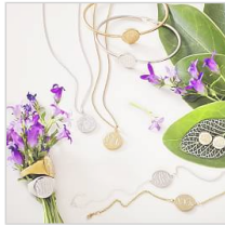
Sarah Chloe Signet Ring $108 - $995