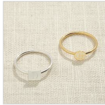
Sarah Chloe Single Initial Ring $89