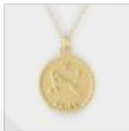
Celeste Zodiac Necklace What's your sign? This chic 14k gold necklace ...