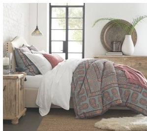
Raleigh Upholstered Low Curved Headboard Side Storage Bed $2,545 – $4,195