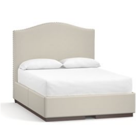
Raleigh Upholstered Tall Curved Headboard Side Storage Bed Sale $1,899 – $4,295