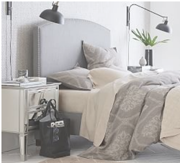
Fillmore Curved Upholstered Tall Bed The slightly angled silhouette of this bed's headboard, ... VIEW MORE