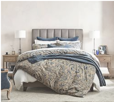
Kira Channel Tufted Upholstered Bed An updated take on Hollywood glamour, our Kira ... VIEW MORE