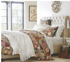
Chesterfield Tufted Upholstered Bed $1,999 – $2,499 Sale $999.99 – $2,499