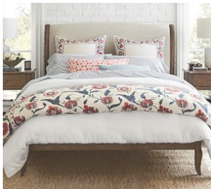
Calistoga Bed $1,399 – $1,599 Special $1,119 – $1,279