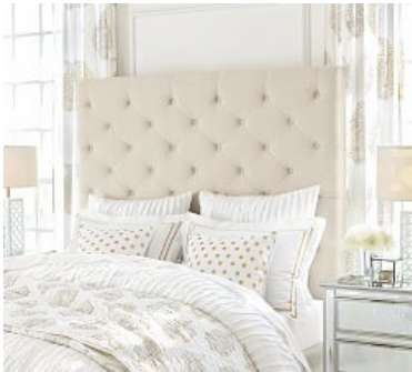
Lorraine Tufted Tall Upholstered Headboard Deeply cushioned and invitingly plush, our headboard evokes ... VIEW MORE