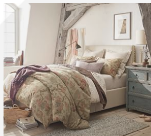
Raleigh Square Low Storage Bed $2,545 – $4,295