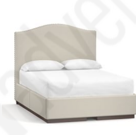
Raleigh Upholstered Tall Curved Headboard Side Storage Bed $1,899 – $4,295