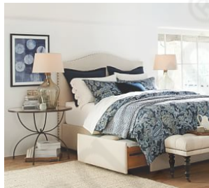
Upholstered Storage Platform Bed With Side Drawers $2,449 – $3,049 Sale $1,468.99 – $3,049