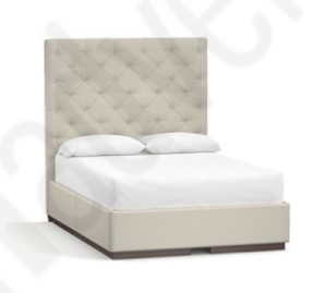
Lorraine Tall Storage Bed $3,645 – $4,545 Sale $2,186.99 – $4,545