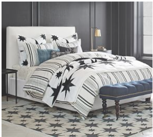
Raleigh Upholstered Square Low Bed $899 – $2,099