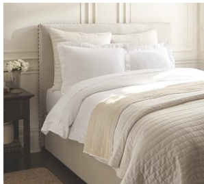
Raleigh Square Tall Storage Bed $1,699 – $4,395