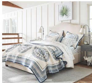
Raleigh Upholstered Curved Tall Bed $999 – $2,199