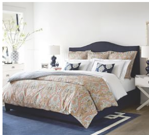
Raleigh Upholstered Curved Low Bed $899 – $4,095