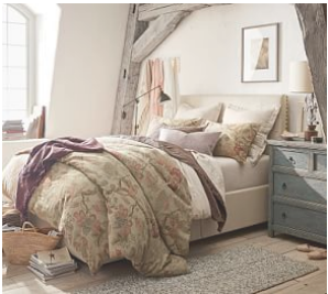
Raleigh Square Low Storage Bed $2,545 – $4,295