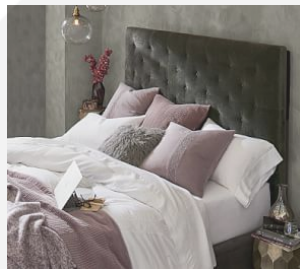
Lorraine Tufted Tall Bed $1,899 – $2,399 Sale $1,138.99 – $2,399