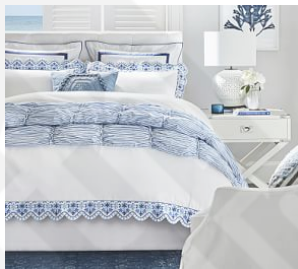
Lorraine Tufted Low Bed $1,399 – $2,299 Sale $838.99 – $2,299