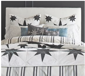
Raleigh Square Upholstered Tall Headboard $587 – $1,349