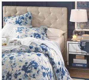
Lorraine Low Storage Bed $3,545 – $4,445 Sale $2,126.99 – $4,445