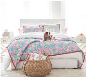
Raleigh Upholstered Square Tall Bed Sale $999 – $2,199