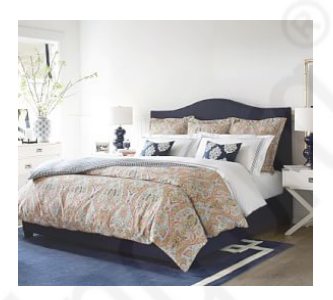
Raleigh Upholstered Curved Low Bed