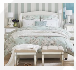
Raleigh Upholstered Wingback Bed $1,399 - $2,599