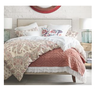
Fillmore Square Upholstered Bed $799 – $1,999