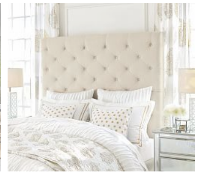
Lorraine Tufted Tall Upholstered Headboard