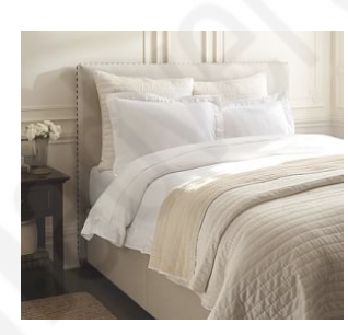
Raleigh Square Tall Storage Bed $1,699 - $4,395