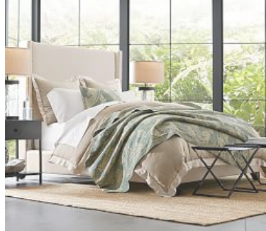
Harper Upholstered Tall Bed