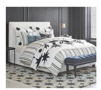
Raleigh Upholstered Square Low Bed $899 - $2,099