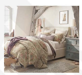
Raleigh Square Low Storage Bed $2,545 - $4,295