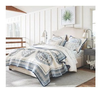
Raleigh Upholstered Curved Tall Bed $999 – $2,199