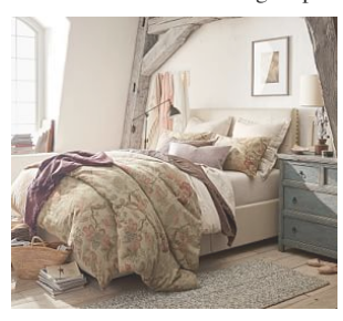
Raleigh Square Low Storage Bed $2,545 - $4,295