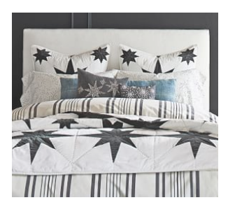
Raleigh Square Upholstered Tall Headboard $587 - $1,349