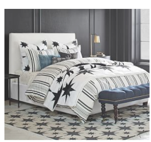
Raleigh Upholstered Square Low Bed $899 - $2,099