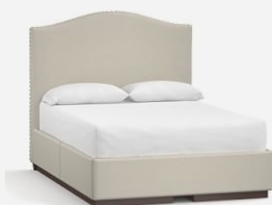
Raleigh Upholstered Tall Curved Headboard Side Storage Bed $1,899 – $4,295