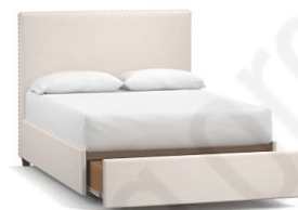
Raleigh Upholstered Square Tall Footboard Storage Bed $2,645 – $4,395