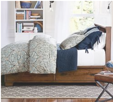
Sumatra Storage Bed With its generous drawers, this bed is a ... VIEW MORE