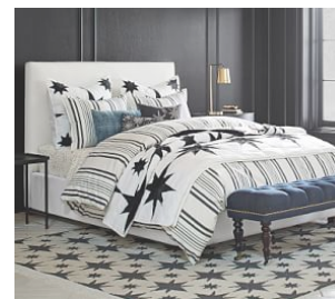
Raleigh Upholstered Square Low Bed $899 – $2,099