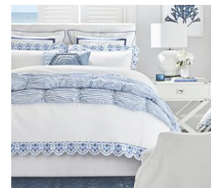
Lorraine Tufted Low Bed $1,399 – $2,299 Sale $838.99 – $2,299