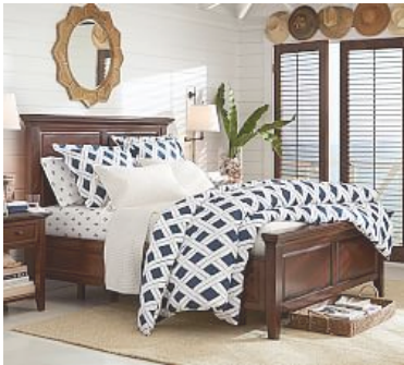
Hudson Storage Bed Defined by exceptional workmanship, the Hudson Storage Bed ... VIEW MORE