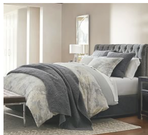
Chesterfield Tufted Upholstered Storage Bed $3,895 – $4,545 Sale $2,439.99 – $4,545