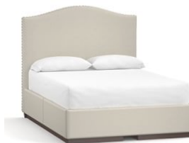
Raleigh Upholstered Tall Curved Headboard Side Storage Bed Sale $1,899 – $4,295