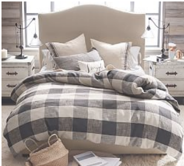
Bryce Buffalo Check Bed Farmhouse modern. Beige tones soften a graphic black ... VIEW MORE