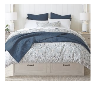
Stratton Storage Platform Bed Frame With Drawers $1,399 $1,599 Special $1,329 - $1,519