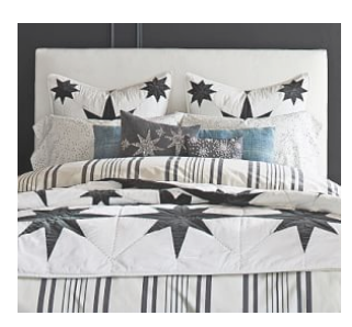
Raleigh Square Upholstered Tall Headboard $587 – $1,349