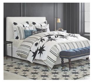
Raleigh Upholstered Square Low Bed $899 – $2,099