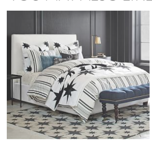
Raleigh Upholstered Square Low Bed $899 – $2,099