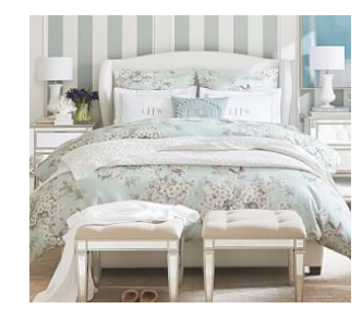
Raleigh Upholstered Wingback Bed $1,399 - $2,599