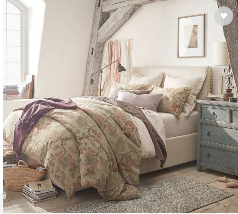
Home > Furniture > Upholstery Crafted In America > Beds & Headboards > Raleigh Square Low Storage Bed