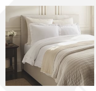
Raleigh Square Tall Storage Bed $1,699 - $4,395