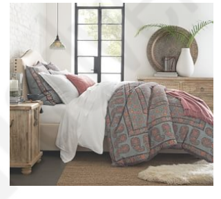
Raleigh Upholstered Low Curved Headboard Side Storage Bed $2,545 – $4,195