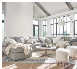
Pearce Roll Arm Upholstered 4-Piece Chaise Sectional With Wedge $4,925 – $6,625