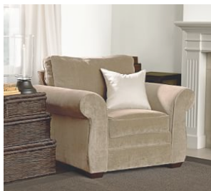
Pearce Roll Arm Upholstered Armchair $1,049 – $1,549