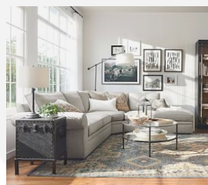
Pearce Roll Arm Upholstered 3-Piece Bumper Sectional $3,625 – $4,875