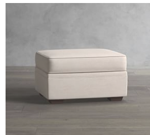
Pearce Upholstered Ottoman $569 – $819