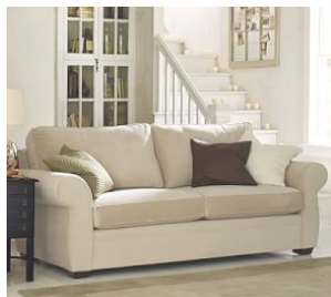
Pearce Roll Arm Upholstered Sofa $1,649 – $2,849