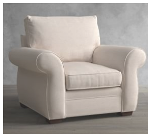
Pearce Upholstered Recliner $1,449 – $1,949