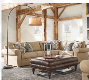
Pearce Roll Arm Upholstered 3-Piece Sectional With Wedge $3,225 – $4,325