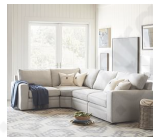
Pearce Square Arm Upholstered 3-Piece Wedge Sectional $3,225 – $4,325