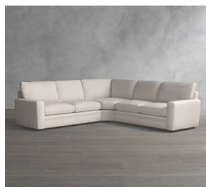
Pearce Square Arm Upholstered 3-Piece L- Shaped Wedge Sectional $3,655 – $4,905