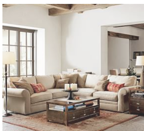
Pearce Roll Arm Upholstered 2-Piece L- Shape Sectional $3,175 – $4,075