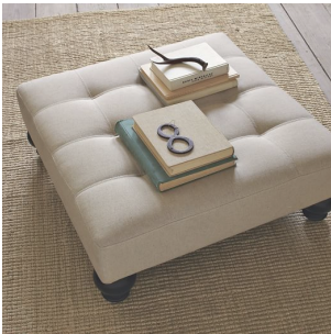
Essex Ottoman $449 Special $360