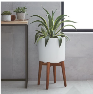
Mid-Century Turned Leg Standing Planters - Solid $479 Special $134