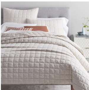
Belgian Linen Quilt + Shams $49 — $299 Special $36 — $224