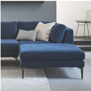
Andes Ottoman $599 — $999 Sale $299.99 — $800