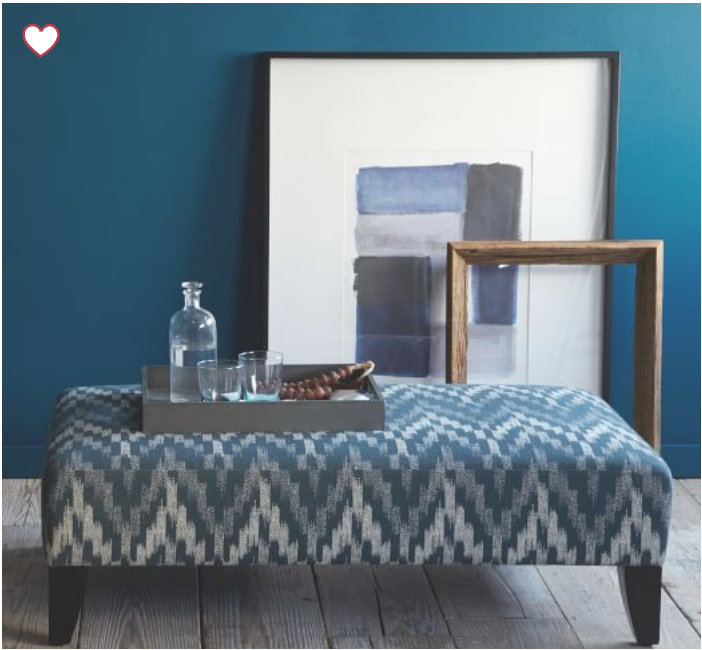
View LargerRoll Over Image to Zoom

Home > Furniture > Sofa + Sectional Collections > Assembled In The USA > Patchen Ottoman