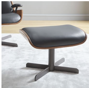
Malcolm Bentwood Leather Ottoman A comfortable companion to our Malcolm Bentwood Swivel ... View More