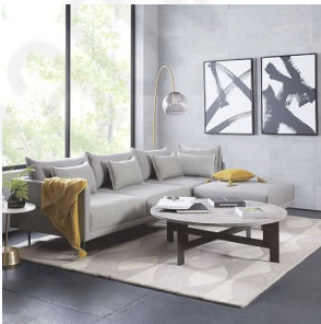
Halsey 3-Piece Sectional The squared silhouette of our Halsey Sectional matches ... View More