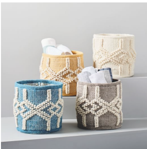
Sweater Knit Baskets $39 Special $29