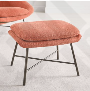
Alvi Ottoman Pair this airy ottoman with our Alvi Chair ... View More