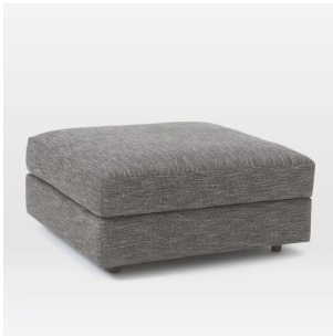
Urban Ottoman $449 — $749 Special $360 — $600