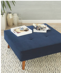
Retro Tillary® Ottoman $499 — $599 Special $400 — $480