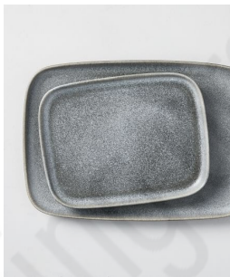
Kanto Platters (Set of 2) $20 — $28 Special $15 — $21