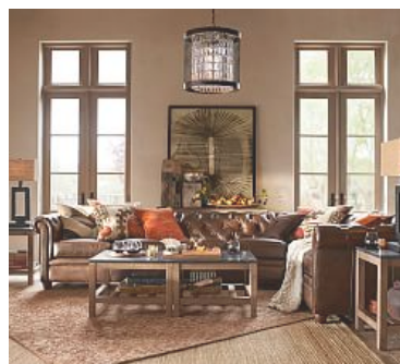
Chesterfield Leather 4-Piece Reversible Grand Sectional