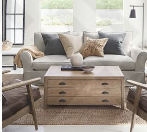
PB Comfort Roll Arm Slipcovered Sofa $1,199 – $3,399