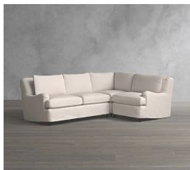
Carlisle Slipcovered 3-Piece Sectional with Corner