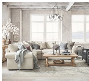
Pearce Upholstered 3- Piece L-Shaped Sectional With Wedge $3,655 – $4,905