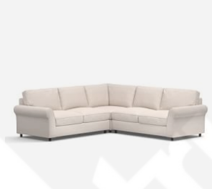
PB Comfort Roll Arm Upholstered 3-Piece L-Shaped Sectional With Corner $3,595 – $6,495