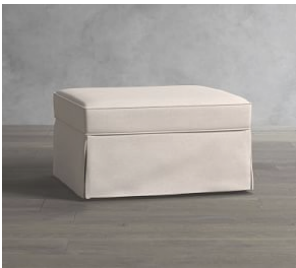
PB Comfort Slipcovered Sectional Ottoman $849 – $1,199