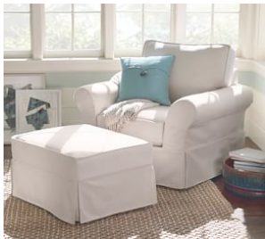
PB Comfort Roll Arm Slipcovered Armchair $1,049 – $2,049