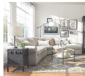
Pearce Roll Arm Upholstered 3-Piece Bumper Sectional $3,625 – $4,875