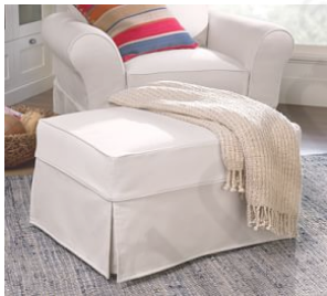
PB Comfort Slipcovered Ottoman $529 – $779