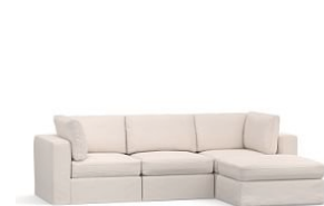
PB Air Square Arm Slipcovered 4-Piece Sofa With Chaise Sectional $4,245 – $6,245