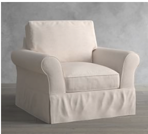
PB Comfort Roll Arm Slipcovered Swivel Armchair $1,149 – $1,849