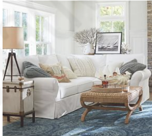
PB Comfort Roll Arm Slipcovered 3-Piece Sectional With Wedge $3,395 – $6,145