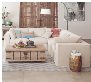
PB Air Square Arm Slipcovered 5-Piece L- Shaped Corner Sectional $5,745 – $8,245