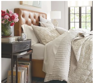
Lorraine Tufted Leather Low Bed $2,299 Sale $1,899.99