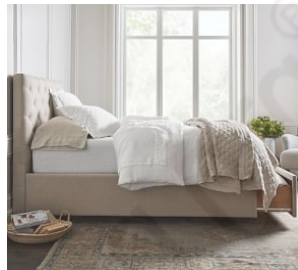
Lorraine Upholstered Low Tufted Footboard Storage Bed $2,795 - $4,445