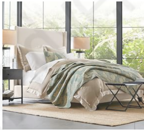
Harper Upholstered Tall Bed $1,649 - $2,849