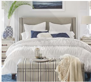
Harper Upholstered Low Bed $1,599 - $2,799