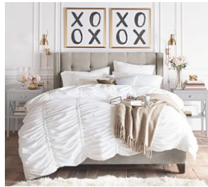
Harper Upholstered Tufted Low Bed $1,649 - $2,849