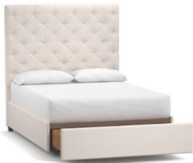
Lorraine Upholstered Tall Tufted Footboard Storage Bed $2,895 - $4,545