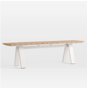
Halden Outdoor Bench - Haze Add a splash of cool, Scandinavian-inspired style to ... View More