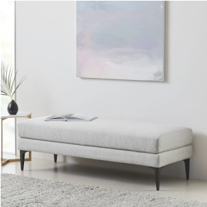
Andes Bench $499 $749 Special $400 – $600