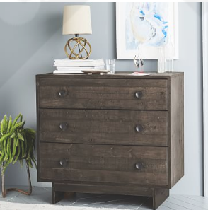
Emmerson® Reclaimed Wood 3-Drawer Dresser - Chestnut Rustic meets relaxed. Made from unfinished reclaimed pine ... View More