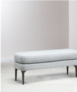
Auburn Bench $499 Special $160