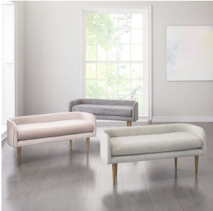
Celine Bench $499 Special $400