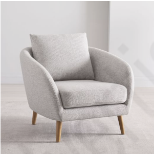
Hanna Chair $599 $799 Special $480 – $640