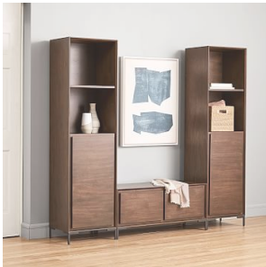
Nolan Entryway Open + Closed Cabinets (2) + Streamlined storage to display or hide away, our ... View More