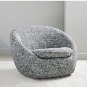
Cozy Swivel Chair $799 $949 Special $640 – $760