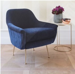
Phoebe Chair $449 $749 Special $360 – $600