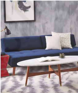
Reeve Mid-Century Oval Coffee Table - Marble Top $799 Special $640