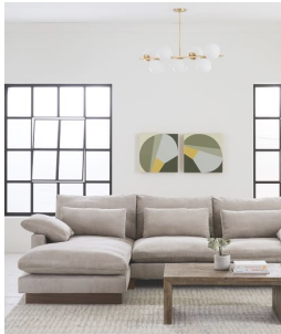
Build Your Own - Harmony Down-Filled Sectional Pieces $599 $2,049 Special $480 — $2,049