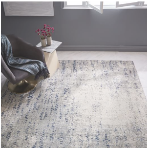
Distressed Foliage Rug $169 $1,199 Special $126 — $1,199