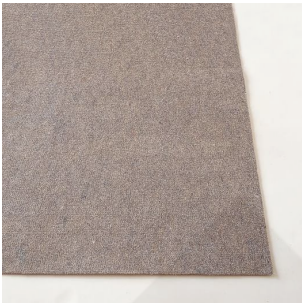
Premium Rug Pad $12 — $119