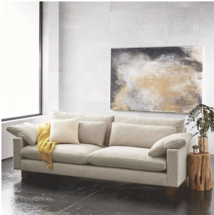
Harmony Down-Filled Sofa (92") $1,799 $2,299 Special $1,440 — $2,299