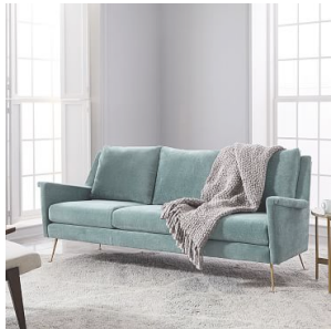
Carlo Mid-Century Sofa (77.5") Strong in profile, our Carlo Mid-Century Sofa echoes ... View More