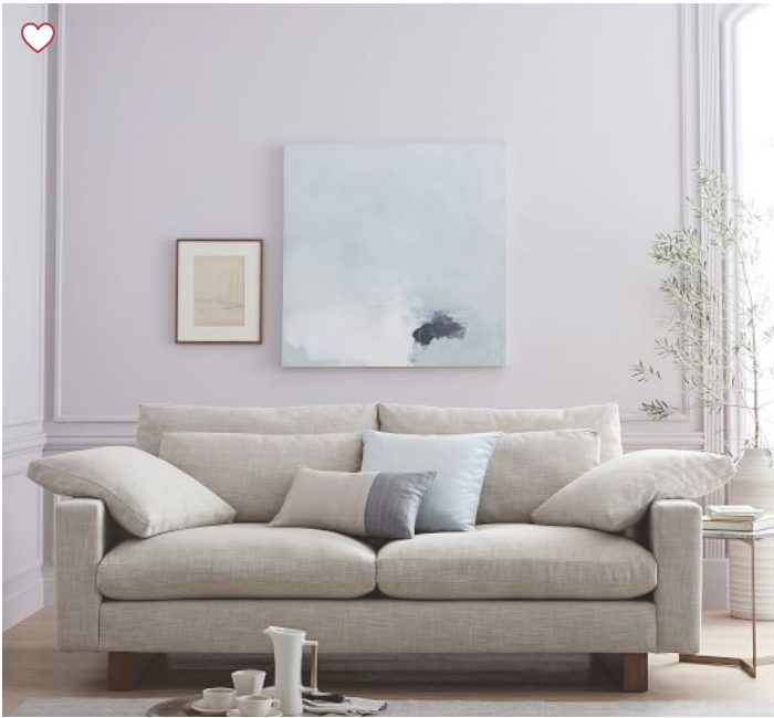
View Larger Roll Over Image to Zoom

Home > Search Results > Harmony Down-Filled Sofa (76")