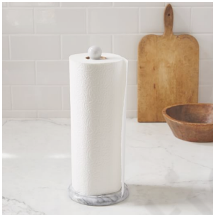
Marble Paper Towel Holder $24