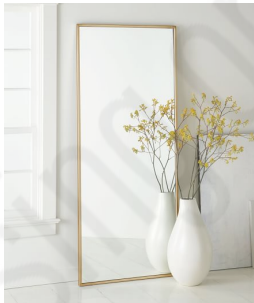
Metal Framed Floor Mirror $499