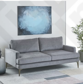
Andes Sofa (76.5") With its modern form, extra-deep seat and crisp ... View More