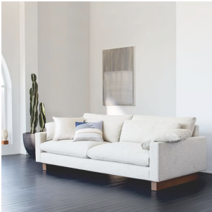
Harmony Down-Filled Sofa (82") $1,799 $2,199 Special $1,440 — $2,199