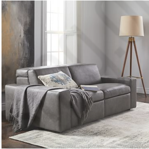
Enzo Leather Sofa (76") Part of our most versatile seating collection to ... View More