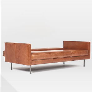
Axel Full Leather Futon (82.5") We transformed our industrial-inspired Axel into a double-duty ... View More