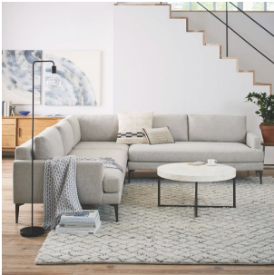
Andes L-Shaped Sectional $3,347 $4,797 Special $2,678 — $3,838