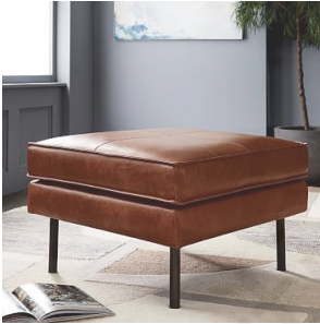
Axel Leather Ottoman Our Axel Leather Ottoman features the highest quality ... View More