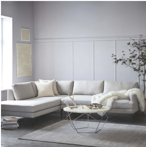
Andes Terminal Chaise Sectional $2,548 $3,648 Special $2,039 — $2,919