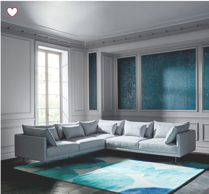
View Larger Roll Over Image to Zoom

Home > Furniture > Sofa + Sectional Collections > Assembled In The USA > Halsey L-Shaped Sectional