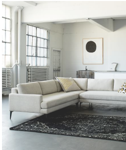
Andes 3-Piece Sectional $3,447 $4,697 Special $2,758 — $3,758