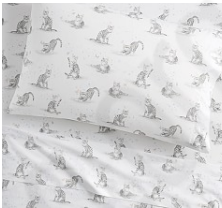
Organic Lulu Kitty Sheet Set $69 - $119 Special $48 - $83