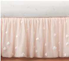
Monique Lhuillier Blush Pink Ethereal Bed Skirt $149 - $199 Special $119 - $159