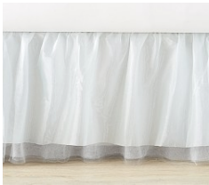
Icy Tulle Bed Skirt $129 - $179 Sale $76.99 - $106.99