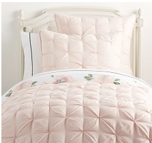
Audrey Quilt $32.50 - $189 Sale $18.99 - $151