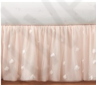
Monique Lhuillier Blush Pink Ethereal Bed Skirt Inspired by ballerinas' voluminous tulle skirts, this bed ...