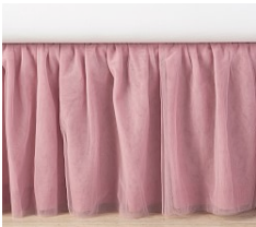
The Emily & Meritt Cotton Tulle Bed Skirt $129 - $179 Special $50.97 - $70.97