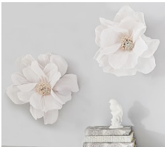
Crepe Paper Flower Decor Set of 2 $39