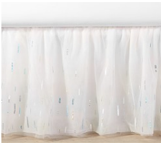
Monique Lhuillier Sequin Embellished Bedskirt $179 - $219 Special $143 - $175