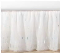
Monique Lhuillier Sequin Embellished Bedskirt Give your little one's sleep space an ethereal ...