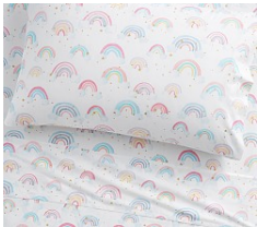
Organic Rainbow Cloud Sheet Set $16.50 - $119