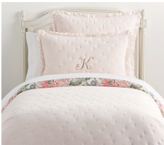
Anna Ruffle Quilt $159 Sale $106.99