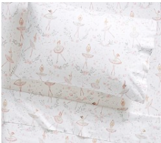
Ballerina Sheet Set $16.50 - $119 Special $13 - $95