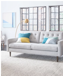
Drake Sofa (76") $999 $1,399 Special $800 – $1,120