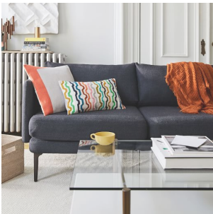
Auburn Sofa (70") $699 Special $560