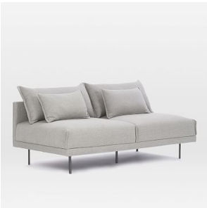
Halsey Armless Sofa (70") The squared silhouette of our Halsey Armless Sofa ...