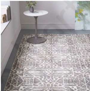
Hieroglyph Wool Rug $399 $1,199 Special $299 – $899