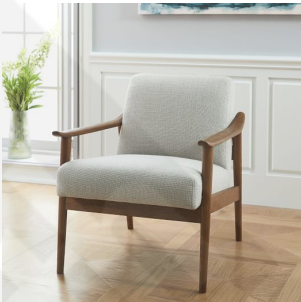
Mid-Century Show Wood Chair $899 $949 Sale $559.99 – $760