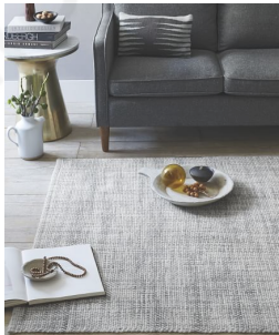
Mid-Century Heathered Basketweave Wool Rug - Steel $429 $799 Special $96 – $599