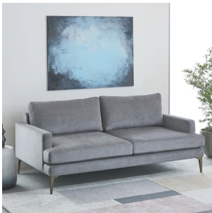
Andes Sofa (76.5") $1,699 $1,899 Sale $1,099.99 – $1,520