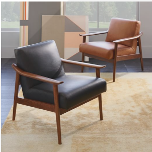
Mid-Century Leather Show Wood Chair $999 Special $800