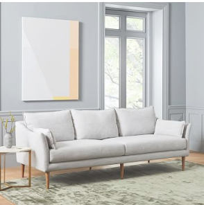
Antwerp Sofa (89") Our Antwerp Sofa takes its cues from Belgian ...