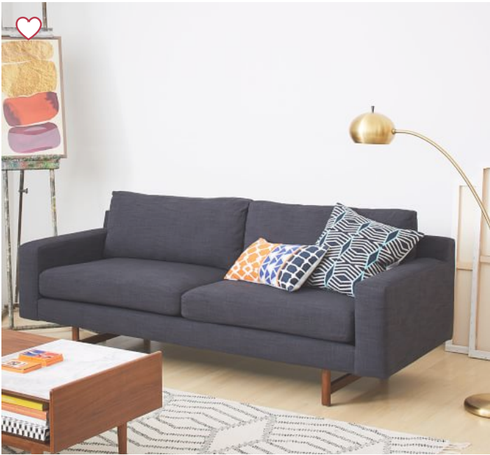
View Larger Roll Over Image to Zoom

Home > Furniture > Sofa + Sectional Collections > Assembled In The USA > Eddy Loveseat (74")