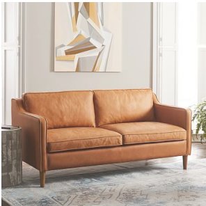
Hamilton Leather Sofa (70") Inspired by 1950s furniture silhouettes, our Hamilton Sofa ...