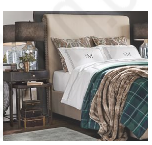
Chesterfield Upholstered Bed $1,349 - $2,549