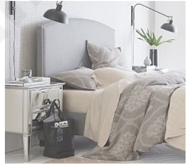
Fillmore Curved Upholstered Tall Bed