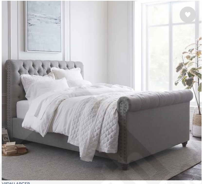
Home > Furniture > Upholstery Crafted In America > Beds & Headboards > Chesterfield Tufted Upholstered Bed With Footboard