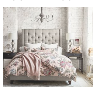
Harper Upholstered Tufted Tall Bed $2,399 - $2,899 Sale $1,438.99 - $2,899