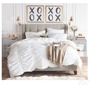
Harper Upholstered Tufted Low Bed $1,649 – $2,849