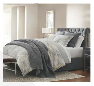
Chesterfield Tufted Upholstered Storage Bed $3,895 $4,545 Sale $2,439.99 $4,545