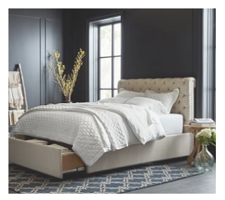
Chesterfield Upholstered Tufted Footboard Storage Bed $2,895 – $4,545