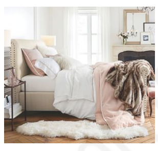
Chesterfield Upholstered Bed With Footboard $1,349 - $2,999