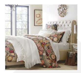
Chesterfield Tufted Upholstered Bed $1,999 - $2,499 Sale $999.99 - $2,499