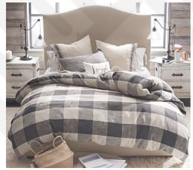
Bryce Buffalo Check Bed