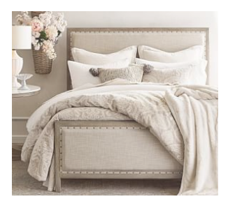
Toulouse Wood Bed $1,599 $1,899 Special $1,519 - $1,804