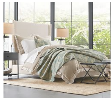
Harper Upholstered Tall Bed