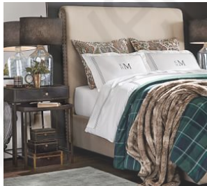
Chesterfield Upholstered Bed $1,349 – $2,549