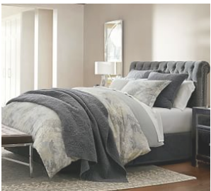
Chesterfield Tufted Upholstered Storage Bed $2,745 – $4,545 Sale $2,439.99 – $4,545