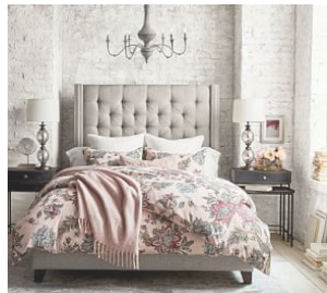
Harper Upholstered Tufted Tall Bed $2,399 – $2,899 Sale $1,438.99 – $2,899