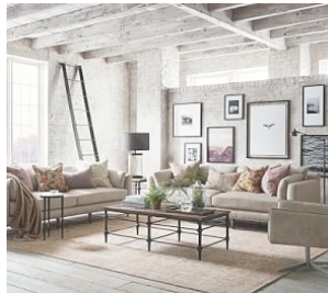
Tallulah Upholstered Sofa $1,199 – $2,499