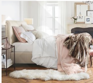
Chesterfield Upholstered Bed With Footboard $1,349 – $2,999