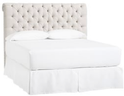
Chesterfield Tufted Headboard $1,299 – $1,599 Sale $649.99 – $1,599