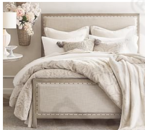
Toulouse Wood Bed $1,599 – $1,899 Special $1,519 – $1,804