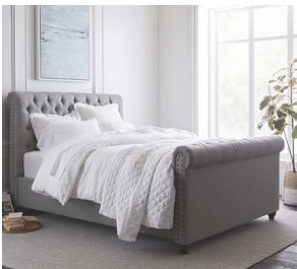
Chesterfield Tufted Upholstered Bed With Footboard $1,799 – $3,049