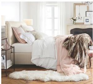
Chesterfield Upholstered Bed With Footboard $1,349 – $2,999